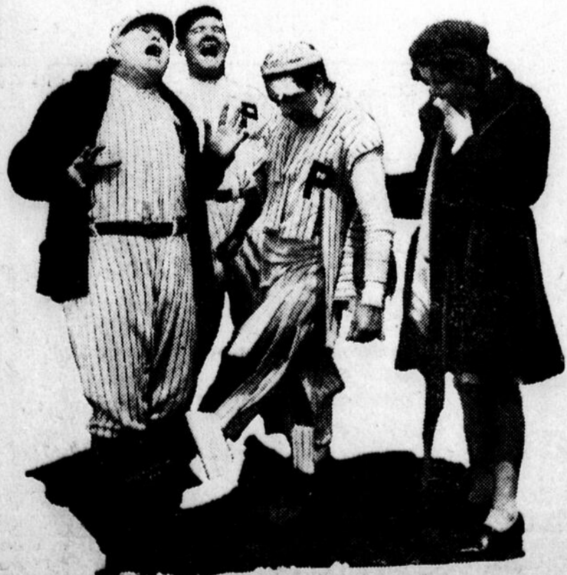
One of the many scenes in "Hot Curves" at Outremont, starting Saturday.