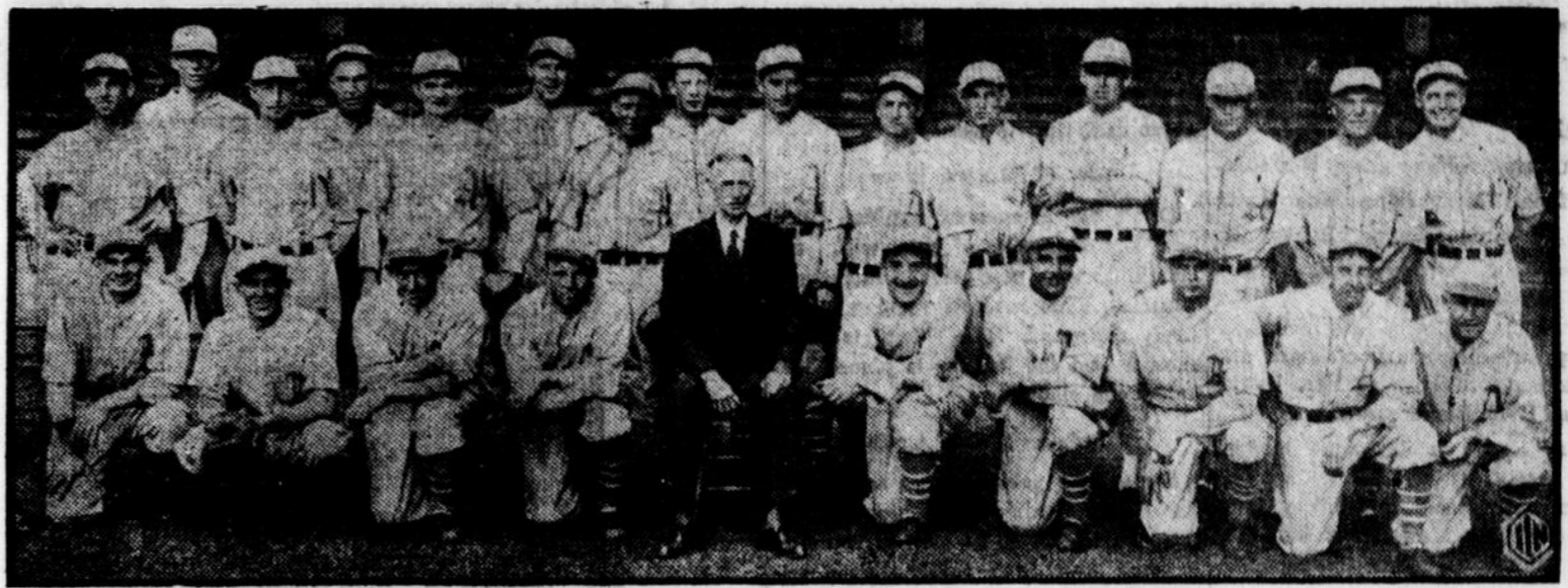
And the Philadelphia Athletics won again yesterday, defeating the St. Louis Cardinals 6 to 1. Here we have the American League champions and from all appearances champions of the world. Connie Mack, veteran pilot, can be seen in the centre of the group.