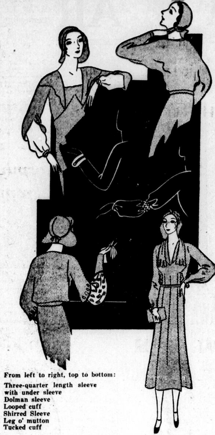
From left to right, top to bottom: Three-quarter length sleeve with under sleeve Dolman sleeve Looped cuff Shirred Sleeve Leg o' mutton Tucked cuff

Three-quarter length sleeves often have an under sleeve that is gathered into a narrow band. This is usually of lace or net and is a popular note for the younger set. Looped cuffs are smart, too. Then there is shirring—the trimming is used to give fullness above the cuffs. Ruffles are sometimes shirred on the outer arm.