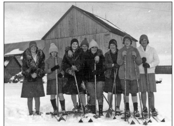
Winter in the Townships: ETRC-P170-box 557_4.jpg Citation: Cross-country skiers in Clifton, ca. 1910.

From December 2010 to April 2011, the Archives Department exhibited materials presenting various aspects of winter life for Town-