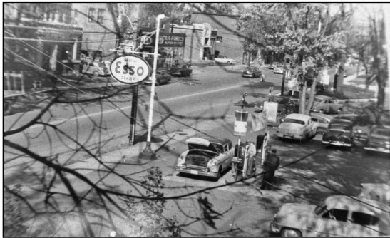
Historic Lennoxville: ETRC-P020-79-4-28.jpg Citation: View of Queen Street, Lennoxville, ca. 1950.