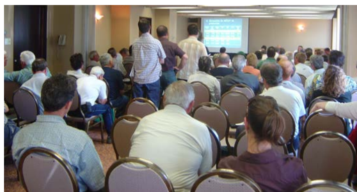
FPAQ's extended Board of Directors, June 14, 2007

In order to develop a fair and well-structured policy that would permit an increase in production as soon as 2008, the Fédération mobilized its leaders and staff, in order to consult with the producers affected by the joint plan, through various methods.