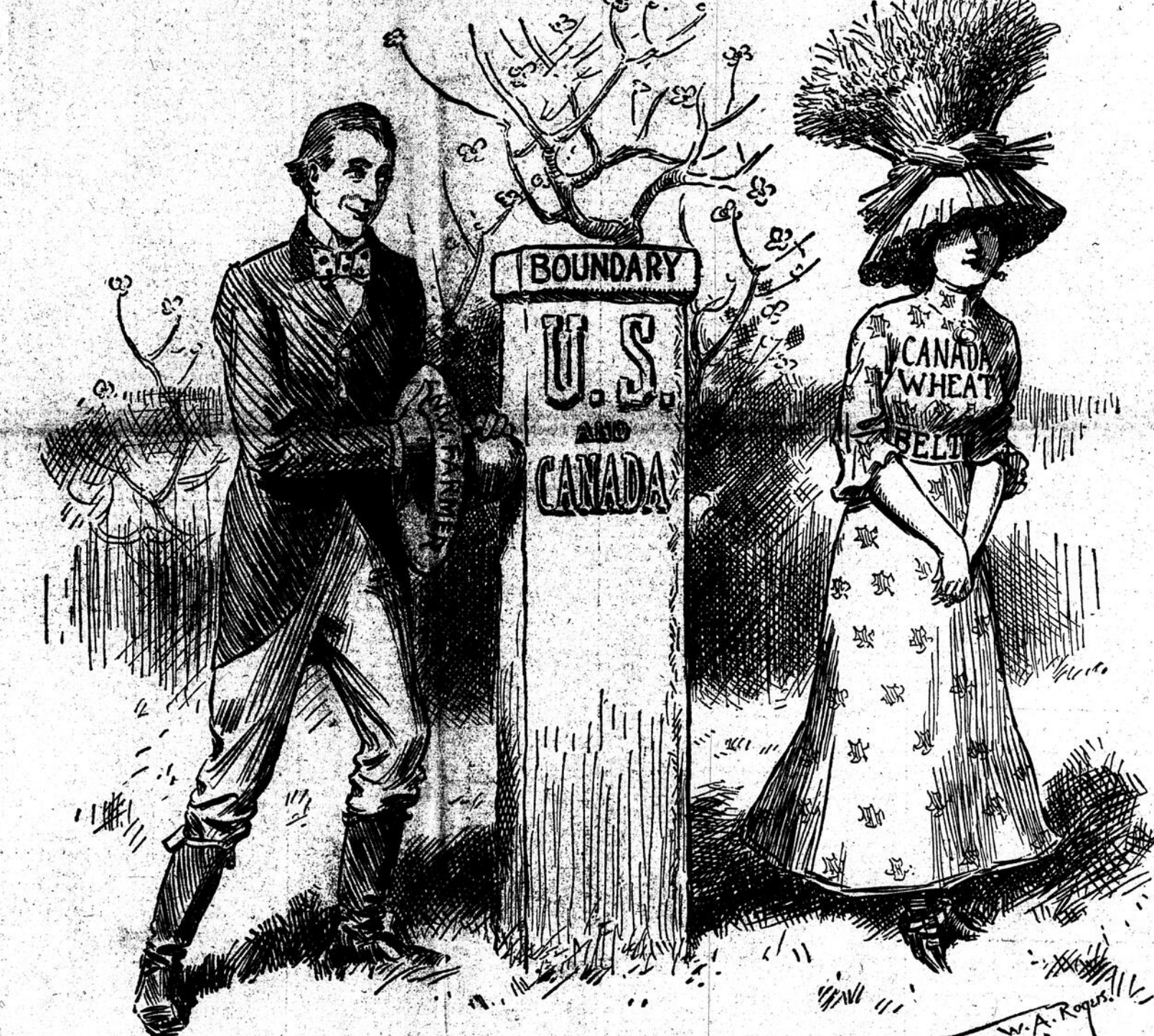
THE FARMER OF THE WESTERN STATES CASTS SHEEP'S EYES AT THE CANADIAN WEST.