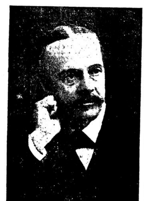
HON. ARTHUR J. BALFOUR, Prime Minister of Great Britain.

London, March 25.—The Irish Secretary, Mr. Wyndham, introduced the Government's long anticipated Irish Land Bill in the House of Commons this afternoon.