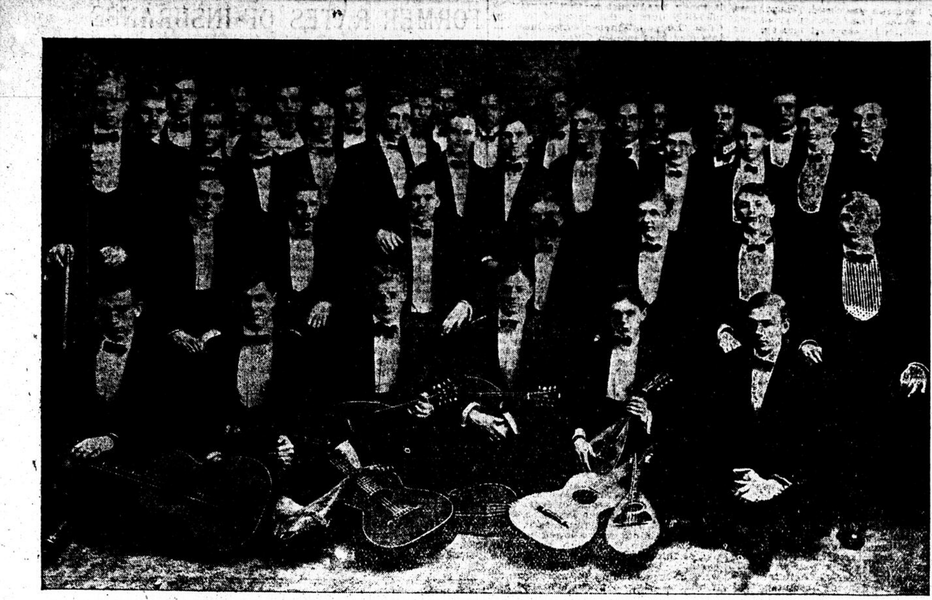
MEMBERS OF THE WILLIAMS COLLEGE MUSICAL ASSOCIATION, AT WINDSOR HALL, NEXT SATURDAY EVENING.

The music-loving public of Montreal will be given an opportunity to gratify their tastes by attending the concert to be given by the Williams College Musical Association, of Williamstown, Mass., in the Windsor Hall next Saturday evening.