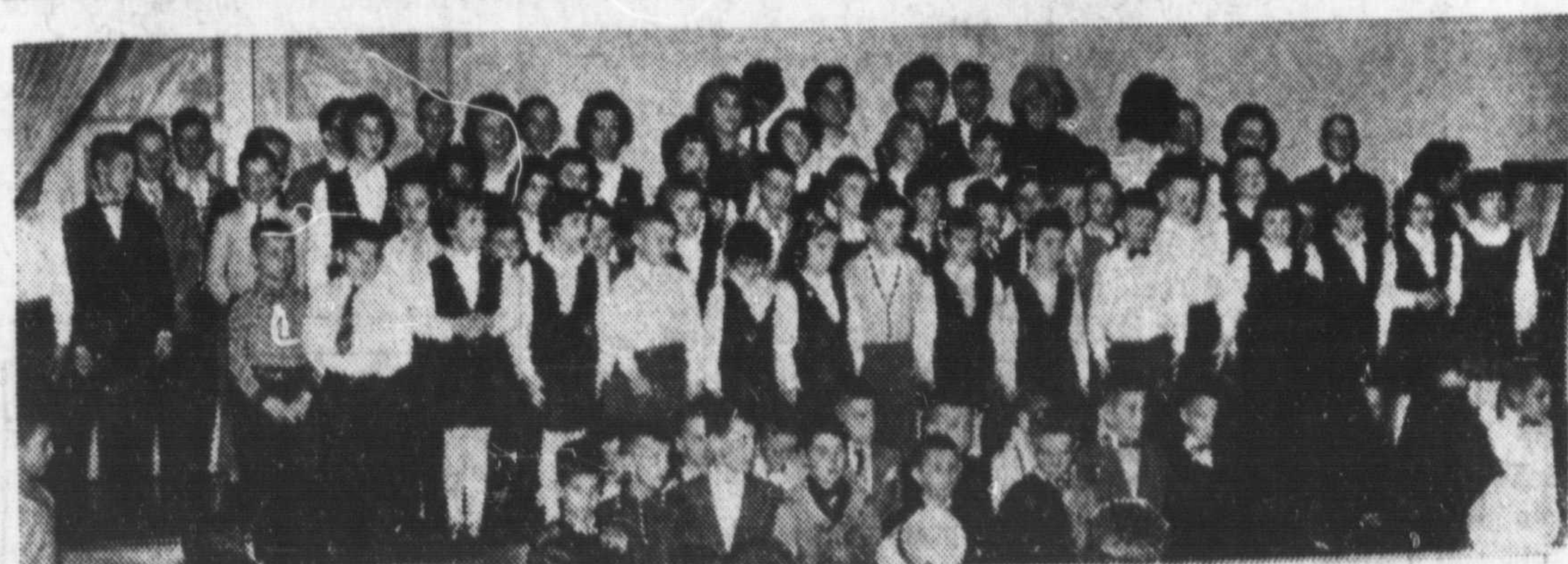
The entire school body took part in the grande finale.