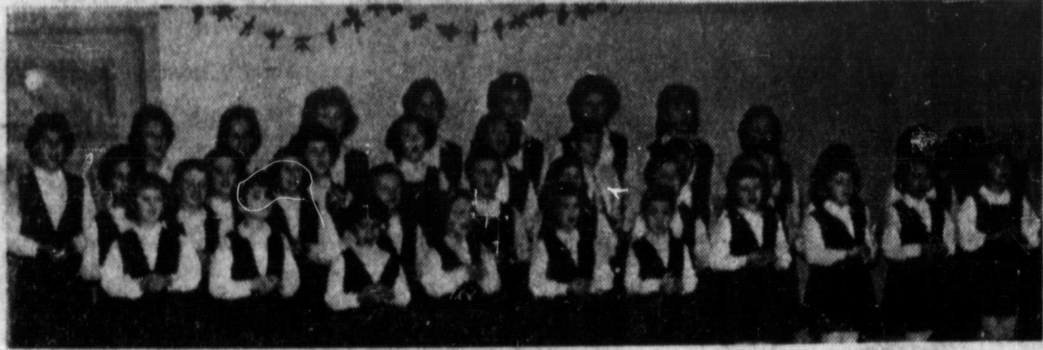
St. Edwards Girls Choir