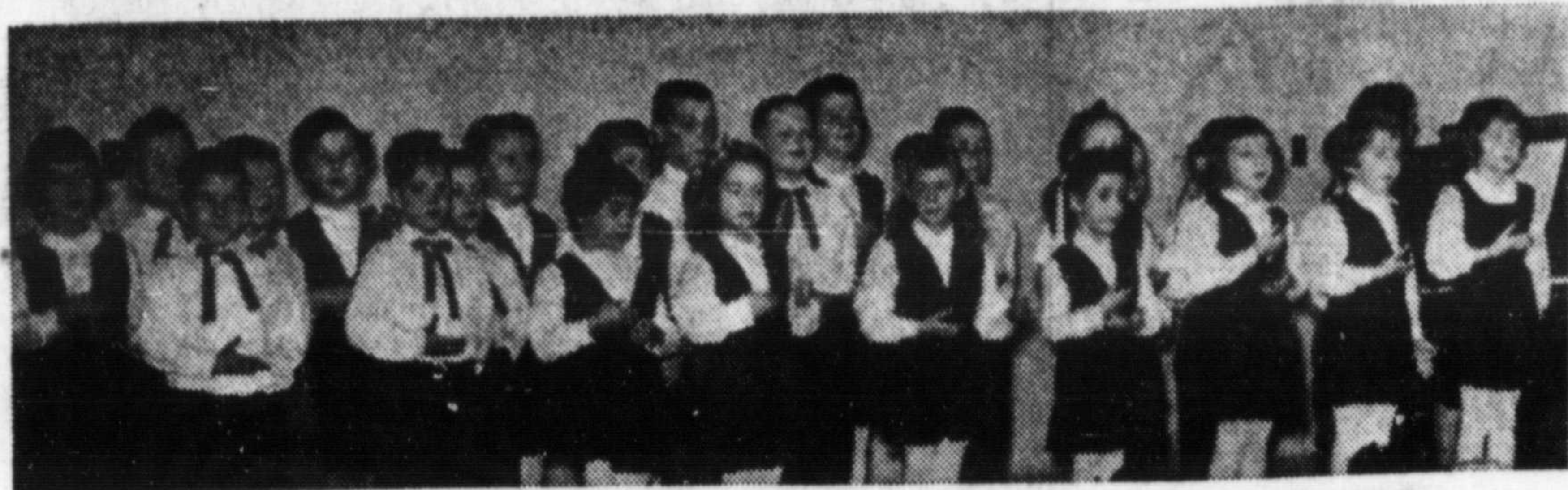
Grades One and Two