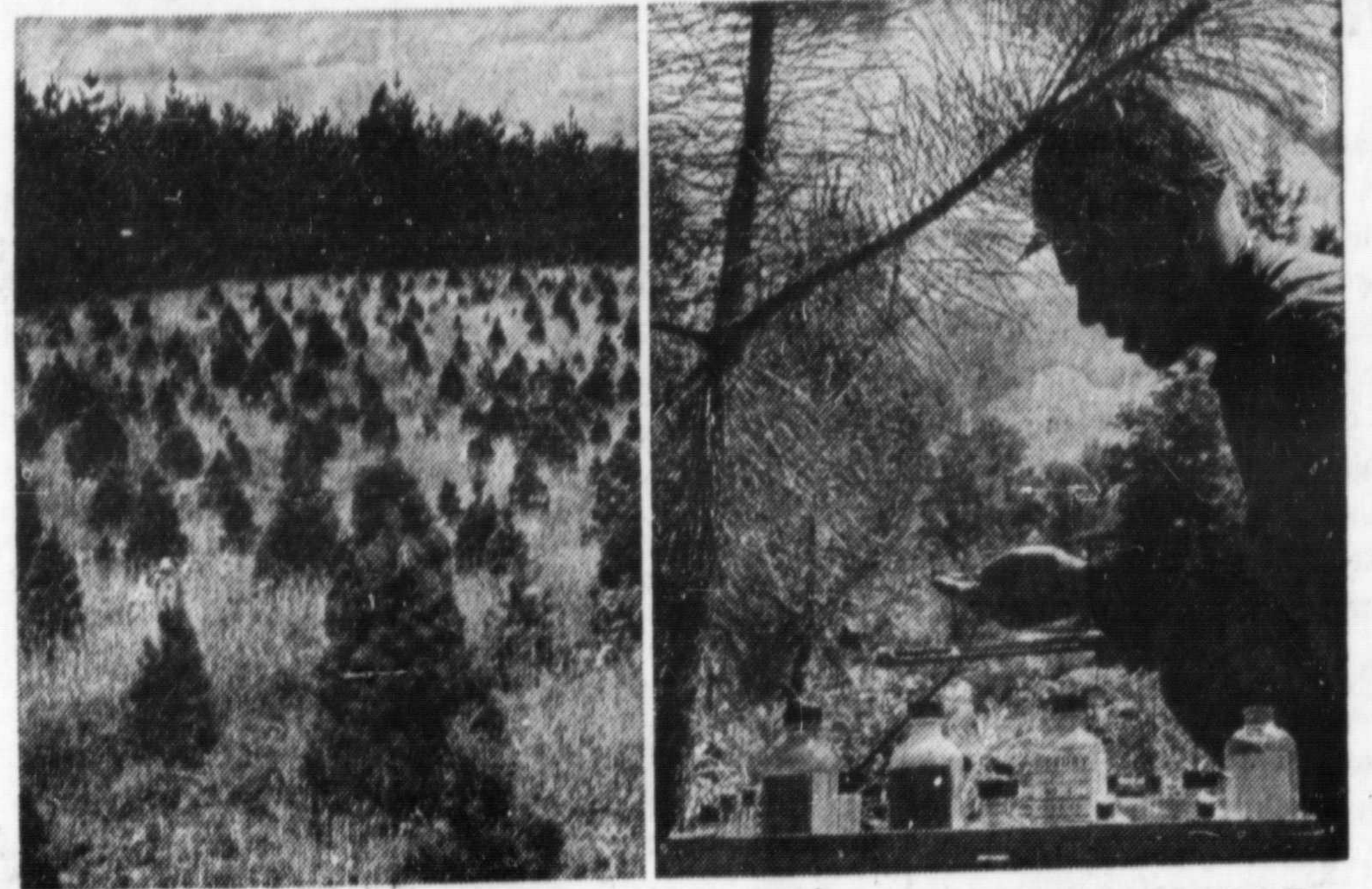
This young forest (left) will not be ready for the harvest until after the year 2000 A.D. Yet because it represents Canada's woodland wealth of tomorrow, the speed and manner of its development are important to all Canadians. Today through such methods as soil analysis (right), foresters are learning more than ever before about tree growth, and their studies are constantly bearing fruit.

To remind Canadians of their dependence on these woodlands, and of the efforts made to manage them effectively, National Forest Products Week is currently being held. From the forest comes, for example, the raw material of the pulp and paper industry, Canada's leading producer, wage payer, and exporter.