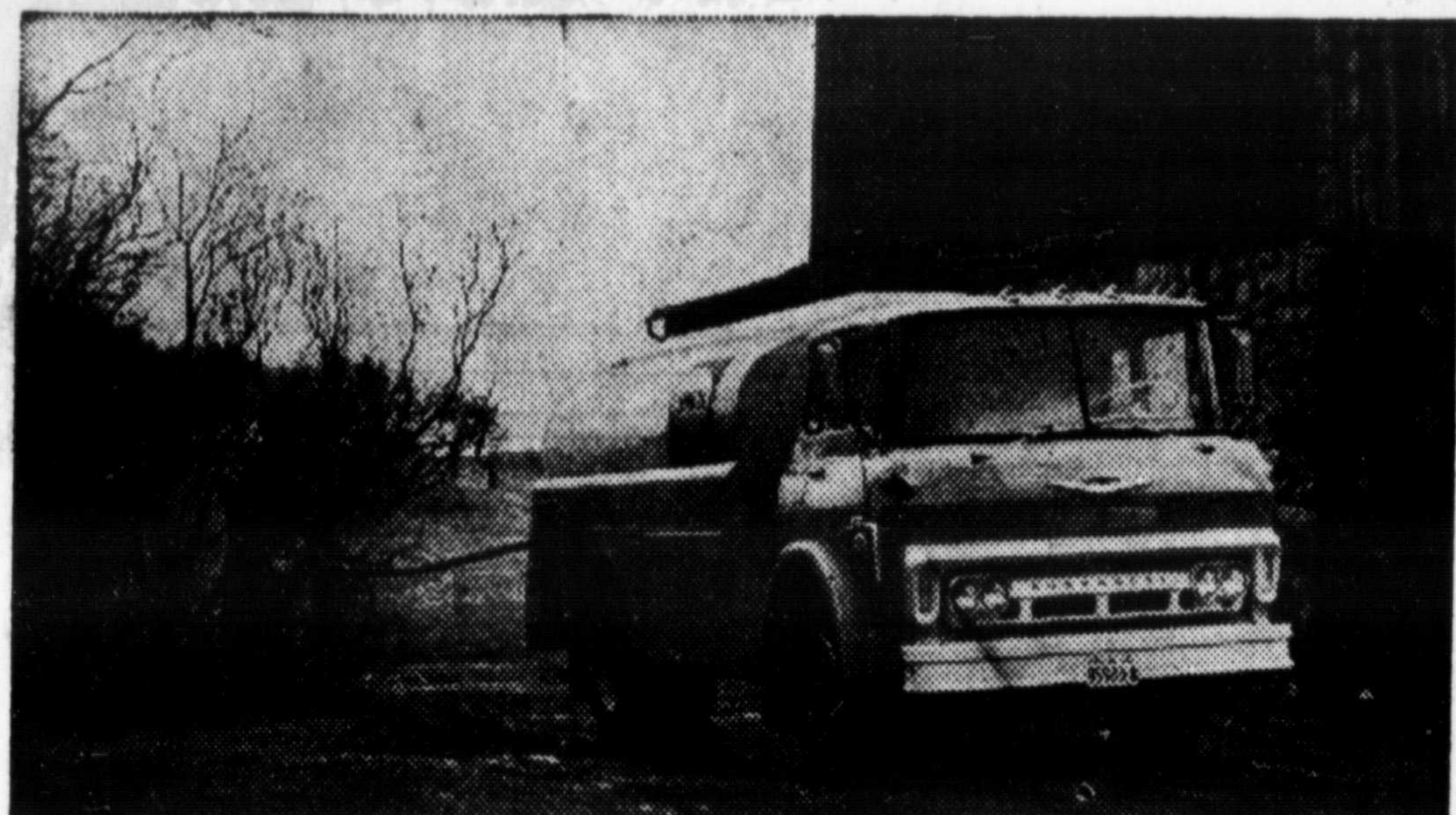
Delivery of Shell petroleum products saves customer hauling time, assures constant supply.

WORKING WITH CANADIANS IN EVERY WALK OF LIFE SINCE 1817