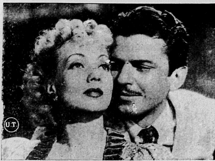
Beautiful Ann Sothern and John Carrol in a scene from the tropical romance "Congo Maisie," which will be an attraction at the Westmount United Theatre starting Sunday playing until Tuesday.