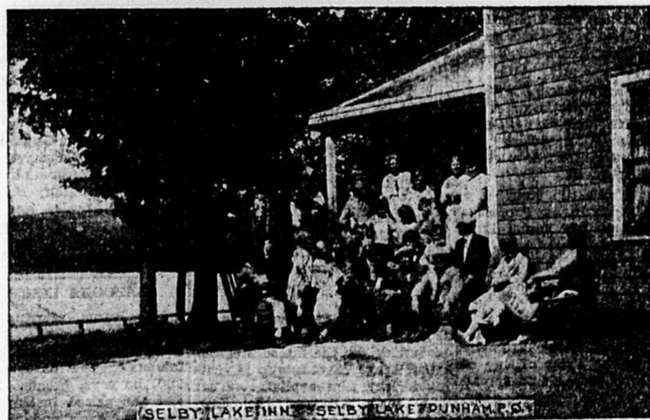
Every year the charms and pleasures of Eastern Township resorts become known to an increasing number of holiday seekers, many of whom make the Selby Lake Inn their headquarters.