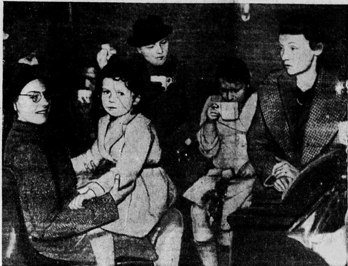
Shocked children, whimpering from fear and hunger, wives whose husbands are battling the Nazi invader back where their homes once were and a bride and bridegroom who were greeted with bombs instead of confetti were among the first shipload of Dutch fugitives from the blitzkrieg to reach safety in England. This weary group found rest and a cheering cup on their arrival in London.