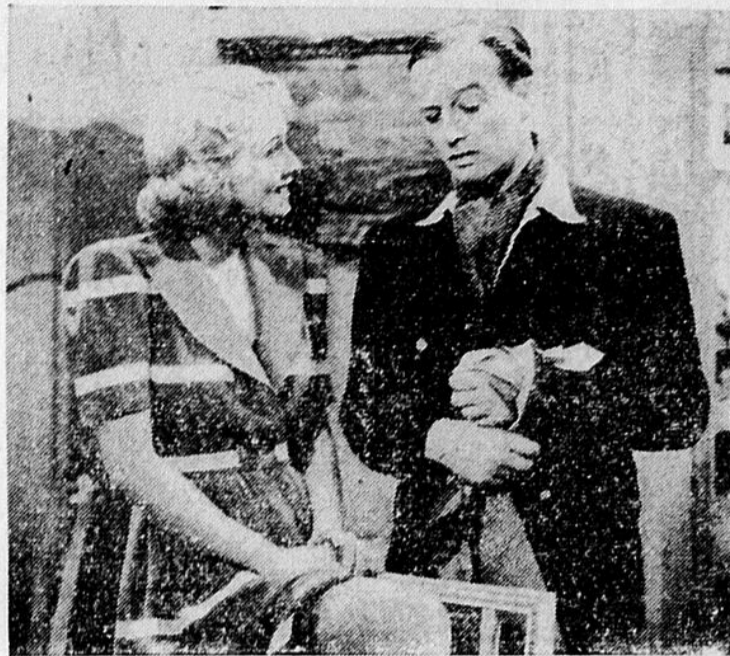
Lovely Ellen Drew and Roland Culver in a scene from the record-breaking comedy attraction "French Without Tears," which is now in its third week at the Snowdon United Theatre.