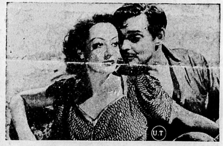
Clark Gable and Joan Crawford in a scene from "Strange Cargo," the powerful melodrama of a group of delinquent souls, opening at the York United Theatre Saturday playing until Tuesday.