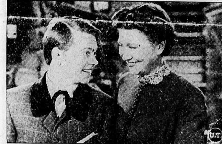
Mickey Rooney and Fay Bainter in a scene from "Young Tom Edison," which is now playing at the Monkland United Theatre until Saturday night.