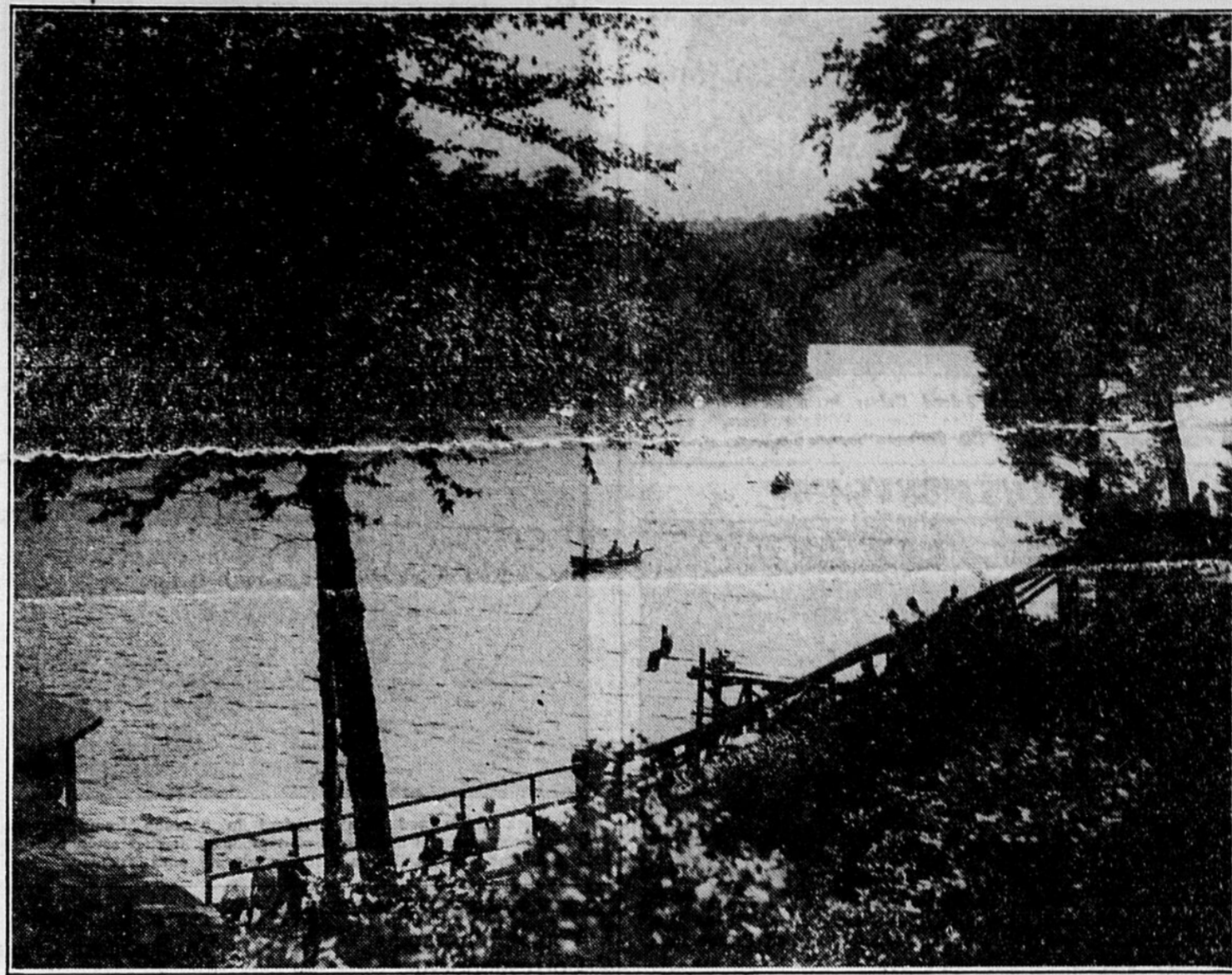
The above photo, snapped near St. Sauveur, depicts to prospective vacationists the ideal surroundings for a "different" vacation offered at many Laurentian resorts. This mountain playground offers every kind of holiday that could be desired, from strenuous mountain climbing to lazy days on a quiet, sandy beach.