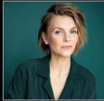
VÉRONIQUE CLAVEAU Céline Dion