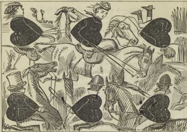
CARD ILLUSTRATIONS—NO. II.