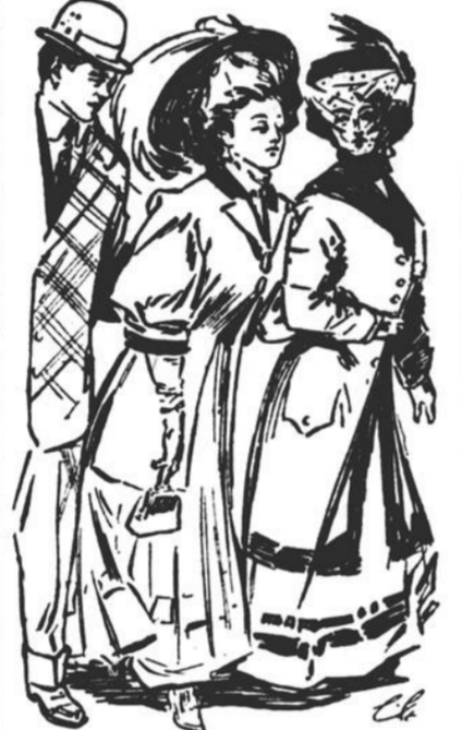
"AH, DON'T PAY ANY ATTENTION TO HIM!" PUT IN BILLY.

"Let's go in Balston's and get an ice," Darlington suggested as an excuse for