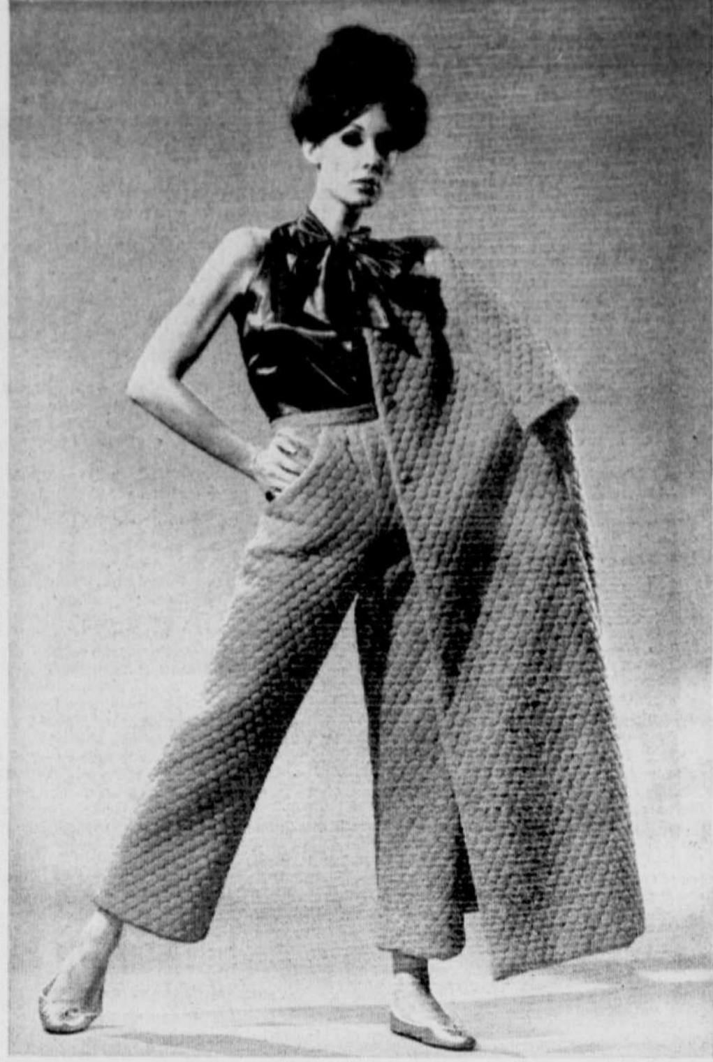
LUXURIOUS LOUNGER in dramatically contrasting colors and textures combines quilted nylon at-home pants with a practical, full-length

Picnics, sometimes called Calais, are cut from the lower part of the shoulder and front leg. They have a higher proportion of fat, skin and bone than the Boston. Regular-style picnic includes the shank, which is largely skin and bone.