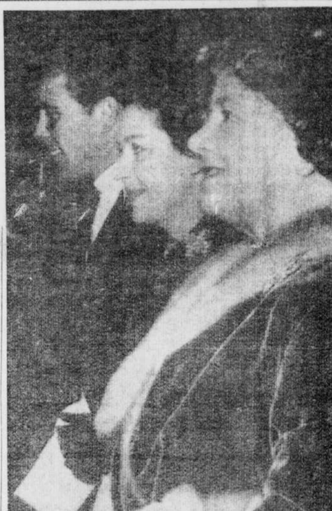
ROYAL ARRIVAL — Arriving for the 900th anniversary celebrations of construction of Westminster Abbey yesterday are, from left, Lord Snowdon, Princess Margaret and Queen Elizabeth the Queen Mother.