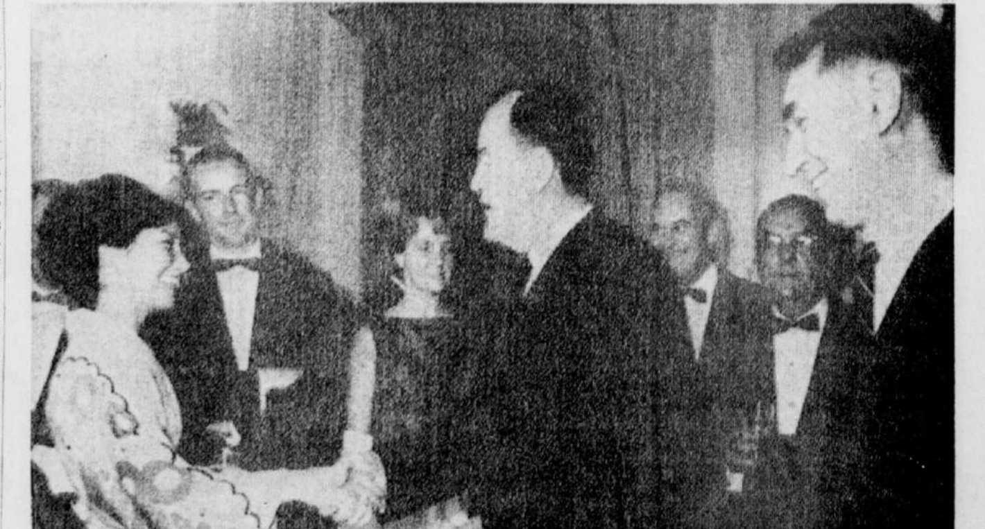
MEET AT U.S. EMBASSY BANQUET — U.S. Vice President Hubert H. Humphrey shakes hands with unidentified kimono-clad Japanese girl at banquet held in the U.S.

In the resignation Fanfani also denied any part in what he called the "imprudent initiative" of his wife in giving a party at his home during which La Pira, controversial former mayor of Florence, was reported to have made his statements.