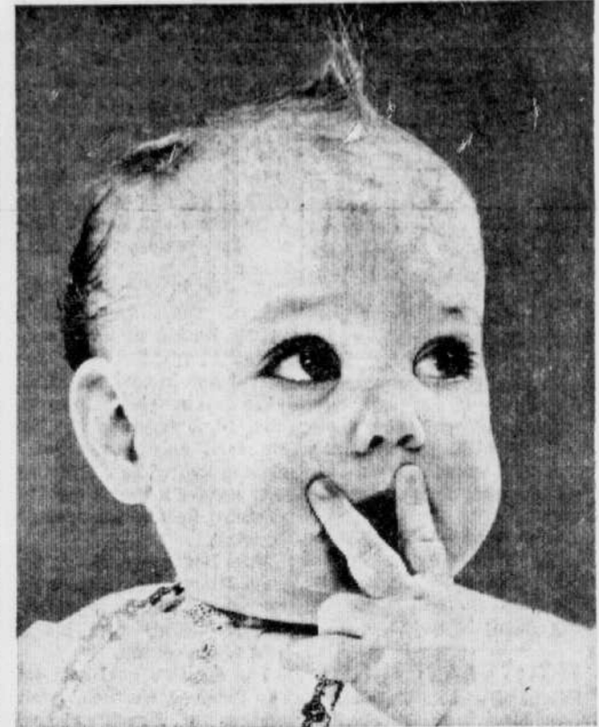
Was I really the first baby of the year?

82 Wellington St. North and the Sherbrooke Shopping Centre