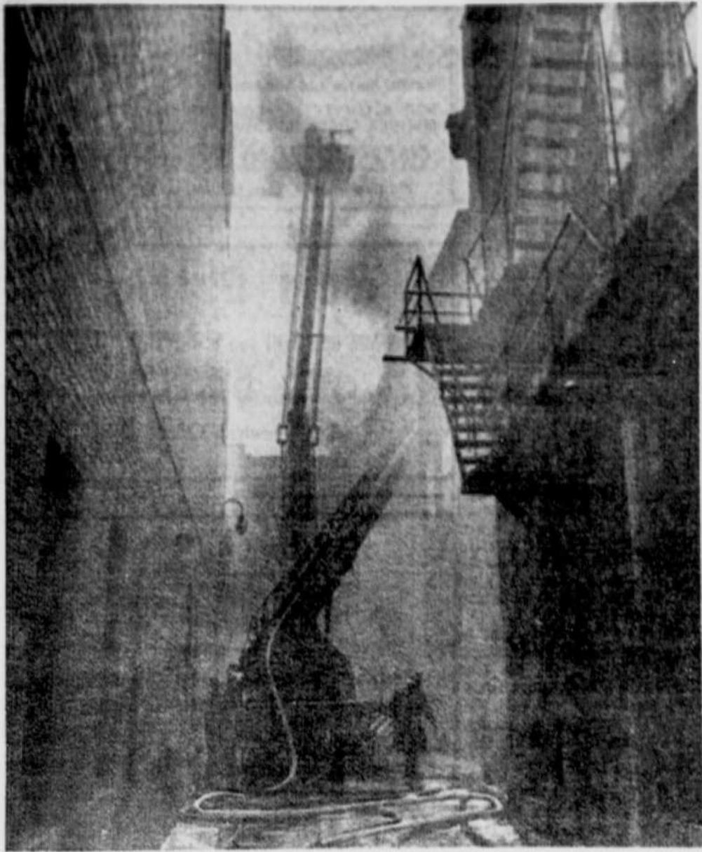
OLD TOWN FIRE — More than 100 firemen, with 25 pieces of equipment, fought a blaze in half a block of buildings Tuesday in the old town of Montreal. A squad of men, using the aerial platform, shown here, moved into an alley to get nearer to the source of the flames. It took two hours to bring the blaze under control. By then, several buildings were gutted.

The Record reserves the right to edit of condense obituaries because of space limitations.