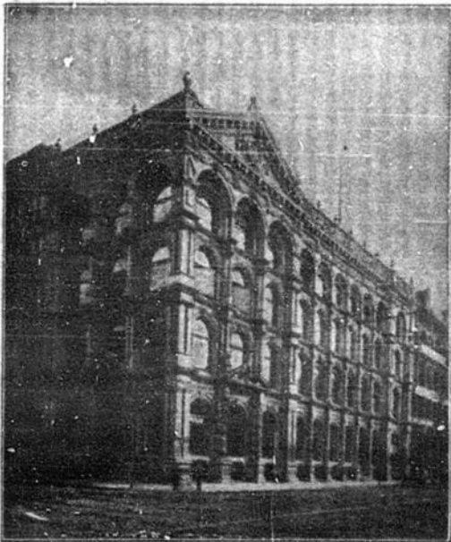
Montreal Building—Victoria Square.