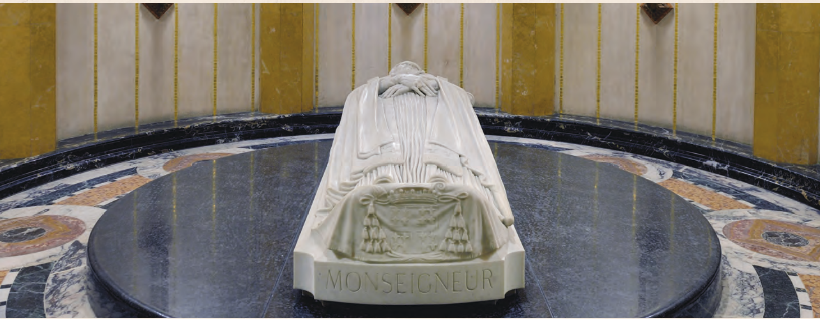
Tomb of François de Laval in the Exterior Chapel of the Québec Seminary, 1950