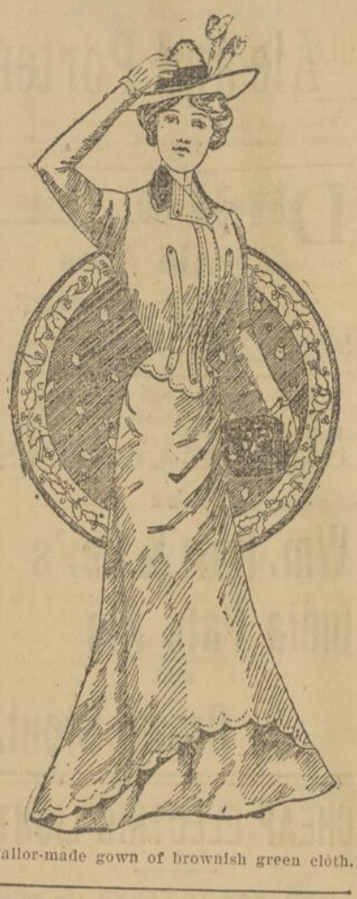
Tailor-made gown of brownish green cloth.