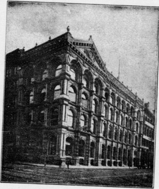
Montreal Building—Victoria Square.