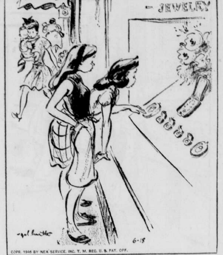
"I might change my mind about being a career girl. Betty, if one of my boy friends would buy me that gorgeous ring third from the left!"