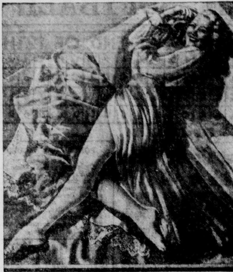
Champagne blonde Adele Jergens brings beauty and glamour to the role of Princess Armina in Columbia Pictures' Technicolor extravaganza, "A Thousand and One Nights," which features her with Cornel Wilde, Evelyn Keyes and Phil Silvers at the Premier Theatre starting tomorrow.