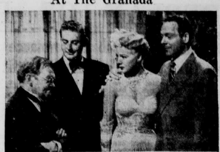
BARRY'S IN TROUBLE! Barry Fitzgerald is seen trying to explain his actions to Don DeFore, Betty Hutton and Bill Goodwin in a scene from "The Stork Club," which starts at the Granada Theatre, Sherbrooke, on Wednesday, playing until Saturday night.