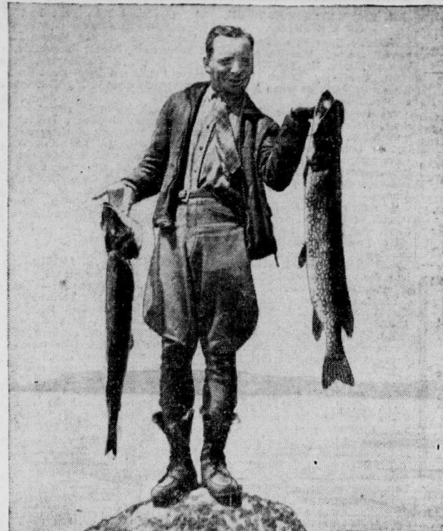
Two that Didn't Get Away

Do you know Quebec? Do you know, for example, that our province is considered an angler's paradise? Atlantic Salmon, Sebago Salmon, Ouananiche, brown, rainbow, speckled, sea, red and grey trout, bass, dore, Muskalonge and Northern Pike... these fighters abound in countless lakes and streams within Quebec's four hundred million acre area!