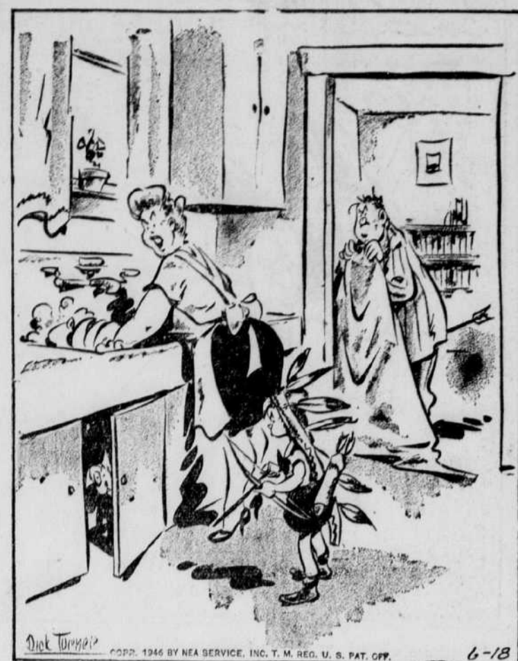
"Junior! Did you wake papa?"