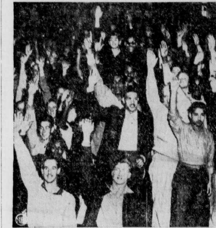
Philadelphia members of the National Maritime Union overwhelmingly vote to accept the agreement reached in Washington settling the threatened nationwide shipping strike.