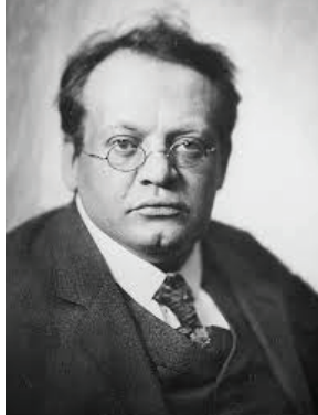
Max Reger (1873-1916)

lasting “für und für”. Amid great fanfare, trombones in the final section intone Luther’s great Reformation hymn “Ein’ feste Burg”. Reger’s choice of dynamic range from pianissimi through gigantic crescendos , including large sections sung fortissimo, leaves the listener breathless.