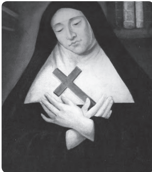
Saint Marie de l'Incarnation