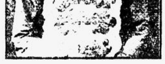
D. MAHER, the most celebrated jockey on the track in New Brunswick. His successes amounted to over 100 per cent.

How I Introduced Baseball into New Brunswick.