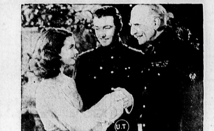
Vivien Leigh, Robert Taylor, C. Aubrey Smith in a scene from the new picture, "Waterloo Bridge," hailed as one of M-G-M's greatest hits, which opens at the York United Theatre starting Saturday playing until Tuesday.