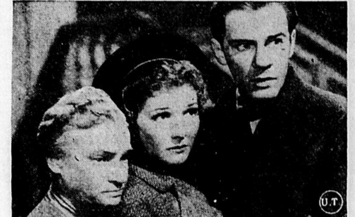
Jean Parker, Richard Carlson and Maria Ouspenskaya in a scene from the first run attraction "Beyond Tomorrow," a picture that is unusual in theme, full of rich human hope and love, now on the screen at the Snowdon United Theatre.