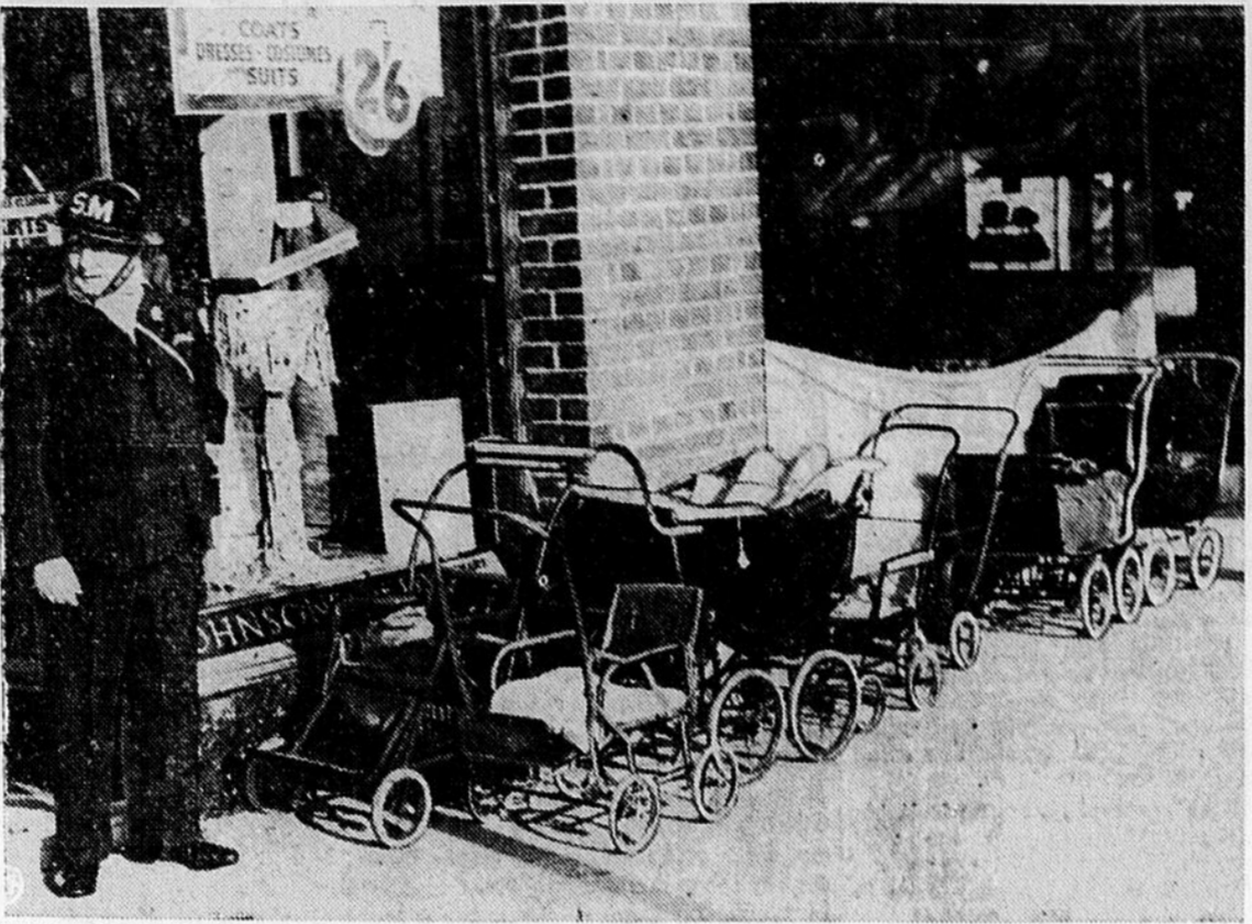
These prams aren't for sale. Far from it. Their small occupants, at the moment photo above was snapped, were safely waiting in an air raid shelter in London while Nazi bombers thrust at the British capital. Shelter marshal, left, keeps an eye on the line of baby taxis while mothers wait below for the "all clear" signal.