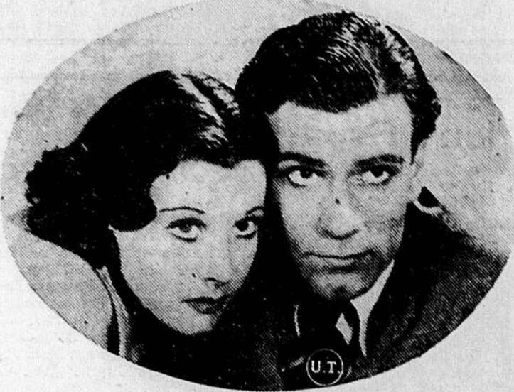
Vivien Leigh and Laurence Olivier co-starred in "21 Days Together," which is now playing at the Westmount United Theatre until Saturday night.