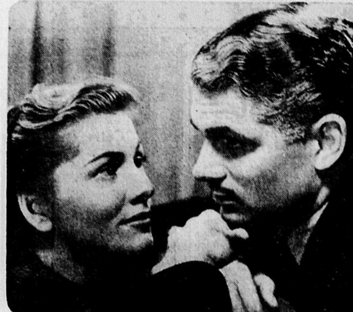
Joan Fontaine and Laurence Olivier the romantic duo of the film "Rebecca," which opens at the Monkland United Theatre on Sunday playing until Tuesday.