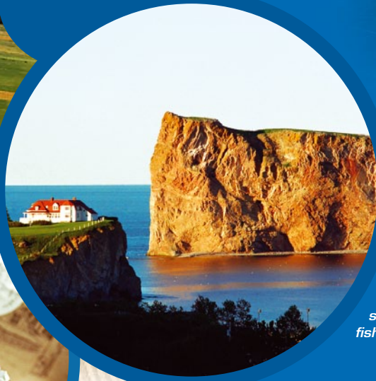
In the rich waters of the Gulf of St. Lawrence, conditions and sustainable fisheries ensure steady natural harvests of not only Nordic shrimp, lobster and snow crab, but also of bottom fish and mollusc species.