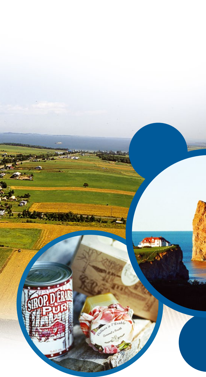
With 75% of the world's maple groves in 2010, Québec leads the world in maple sugar production.