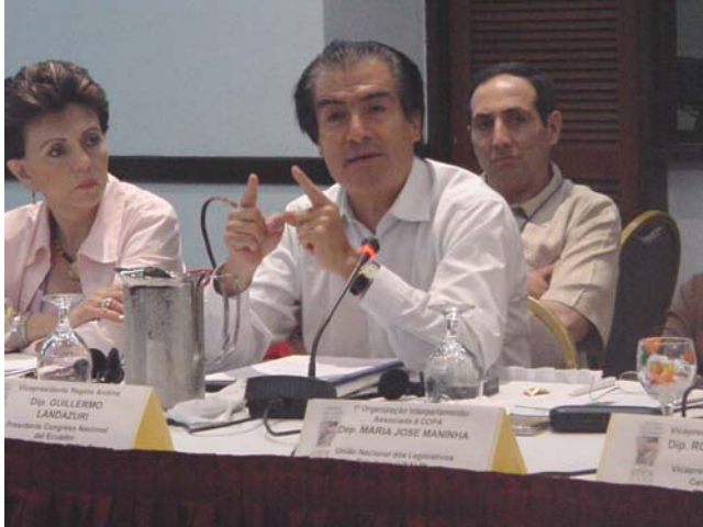
Representative Guillermo Landázuri, President of the National Congress of Ecuador and President of the COPA Committee on the FTAA.