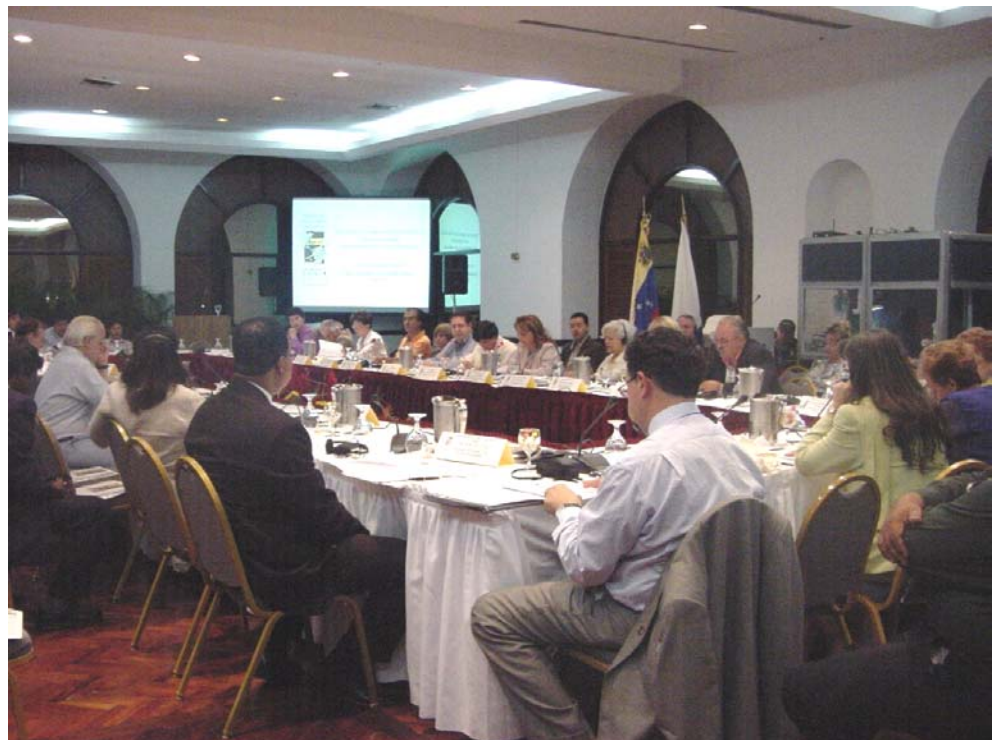
Meeting of the Executive Committee of COPA, Margarita Island, State of Nueva Esparta.

Logo designed for the VIII Meeting of the Executive Committee of the Parliamentary Confederation of the Americas (COPA), which took place on Margarita Island, State of Nueva Esparta, Bolivarian Republic of Venezuela, from February 21 to 24, 2003.