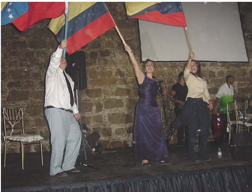
The “Venezuelan Evening”, organized by the Government of the State of Nueva Esparta and the Tourism Corporation of Nueva Esparta