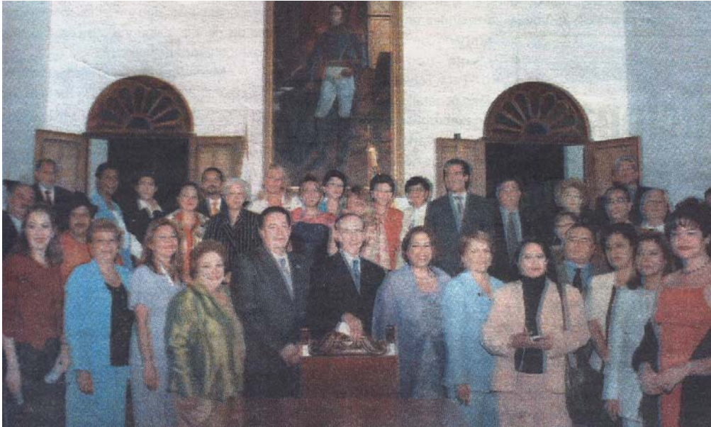
Parliamentarians attending the Closing Ceremony.