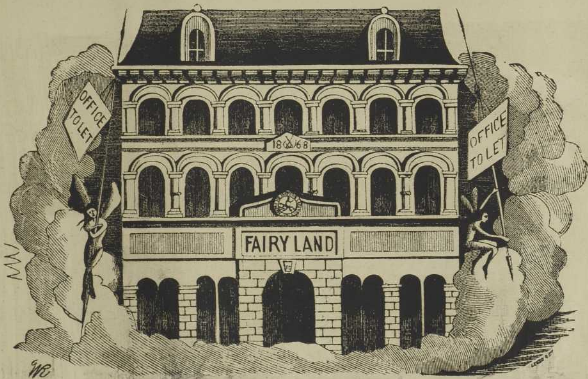
THIS IS A VIEW OF FAIRY LAND.