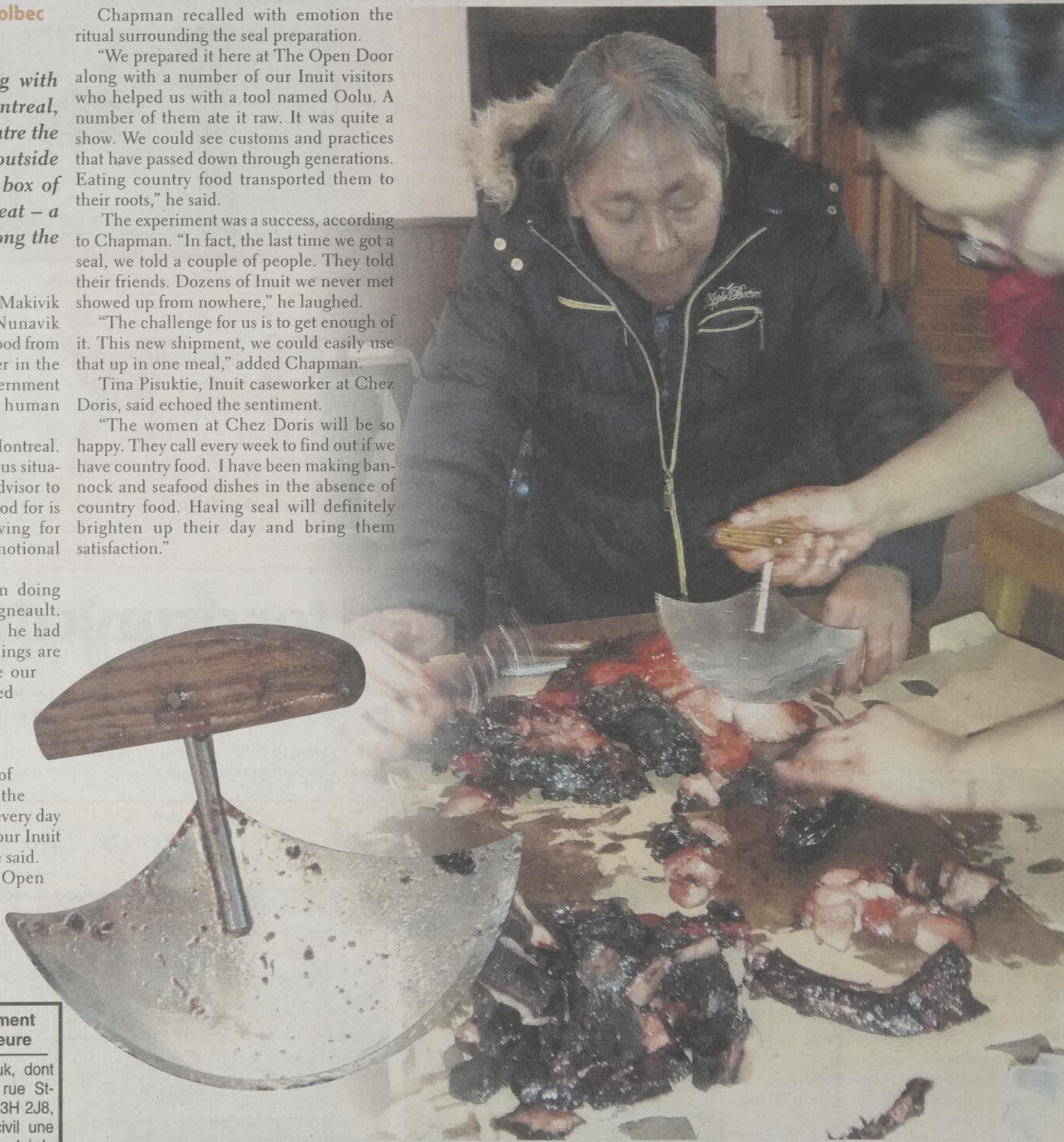
An Oolu, a traditional tool used to prepare seal meat. – Special contribution

"The women at Chez Doris will be so happy. They call every week to find out if we have country food. I have been making bannock and seafood dishes in the absence of country food. Having seal will definitely brighten up their day and bring them satisfaction."