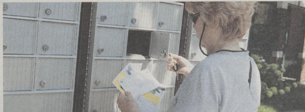
Westmount will join legal effort to fight Canada Post' community mailboxes.

Trent, along with Coderre and the ASM cities, have criticized the crown corporation's decision, as well as their lack of cooperation with Canadian municipalities. In fact, Trent