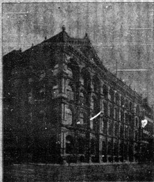
Montreal Building—Victoria Square.