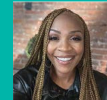
DIVINE BROWN Featured Performer