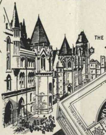
THE LAW COURTS London