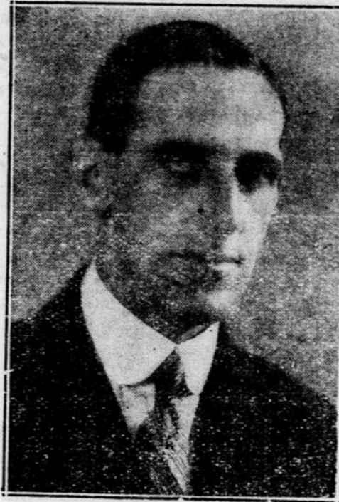
Right. - Brig.-Gen. Smart, Conservative Standard-bearer at Quebec who is again practically the unanimous choice of the "blue" group.