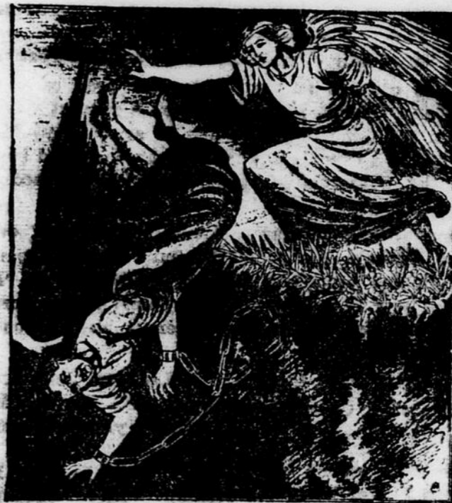
Cast Him (Satan) Into "The Bottomless Pit."

Millions Now Living Will Die Twice, Some Will Never Die