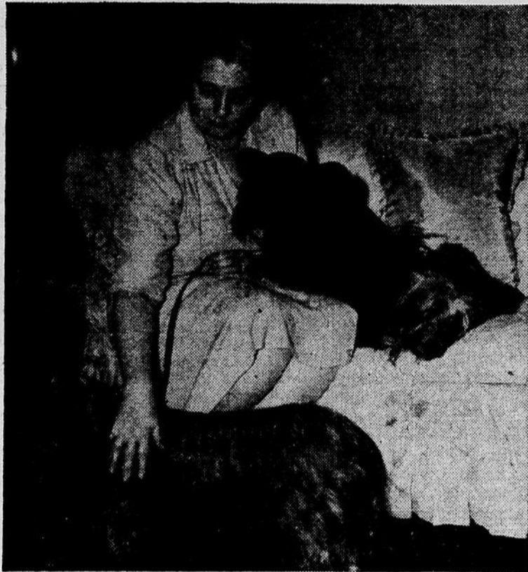
WINNER AT MADISON SQUARE GARDENS

F. L. SILVER High Class Ladies' and Men's TAILOR Good assortment of imported goods always in stock Repairing, cleaning and pressing 4883 SHERBROOKE WEST ELwood 0082