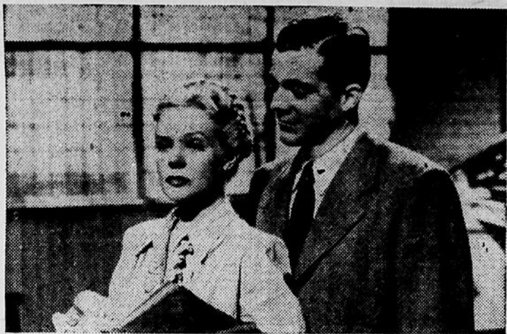
ALICE FAYE and DANA ANDREWS, who are starred in the mystery drama, "Fallen Angel," which starts at the York United Theatre on Saturday until Tuesday night.