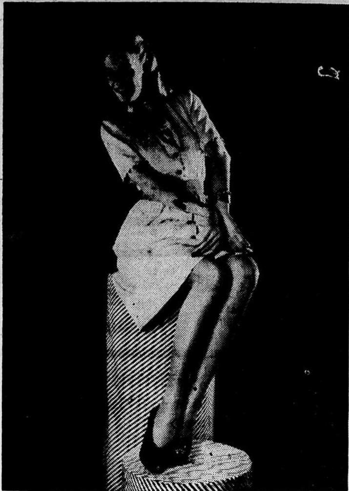
SHE GOT 'EM

The annual exhibition of the Women's Art Society will be held at the Art Association of Montreal, Sherbrooke Street West, on March 1st to 10th inclusive. The opening for members will take place at 3 p.m., March 1st. The paintings include works by the Studio Group and members of the Society.