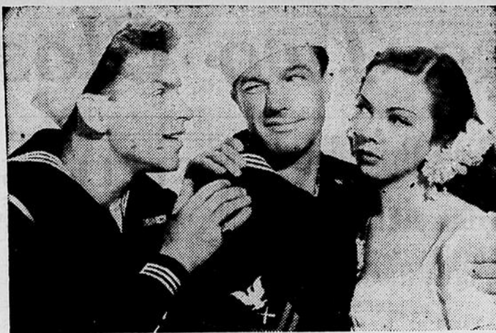
FRANK SINATRA, GENE KELLY and KATHRYN GRAYSON, who are starred in the breezy, Technicolor musical feature, "Anchors Aweigh," which starts at the Seville United Theatre on Saturday until Tuesday night.

"Well, Aunt Mandy, I suppose you are glad the war is over?" "Well, I jest don't know about dat," answered Mandy. "Cose, Ise glad to have Bill back home and all dat, but I jest know I ain't gwine to get money from him so regular as I did when he wuz in de army and de government was handlin' his financial affairs."