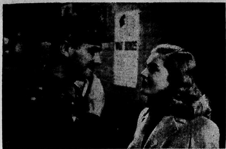
ROBERT CUMMINGS and LIZABETH SCOTT, who are starred in "You Came Along," a gay but tender love-story of our times which starts at the Monkland United Theatre on Saturday until Tuesday night.