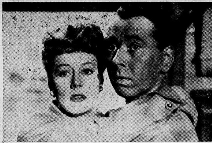
IRENE DUNNE and ALEXANDER KNOX, who appear with Charles Coburn, in the hilarious comedy, "Over 21," which starts on Sunday at the Westmount United Theatre.

First eight months of 1945 saw a rise of 4034 miles in air routes available for passenger travel.