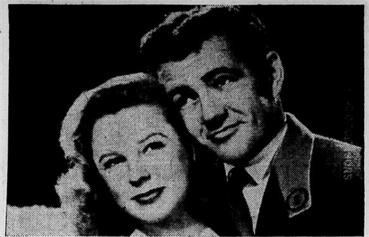
JUNE ALLYSON and ROBERT WALKER, who are co-starred with Hedy LaMarr in the bright, new comedy hit, "Her Highness and the Bellboy," which starts at the Snowdon United Theatre on Saturday for a week.

The farmer drawled, "It went back for more rocks."