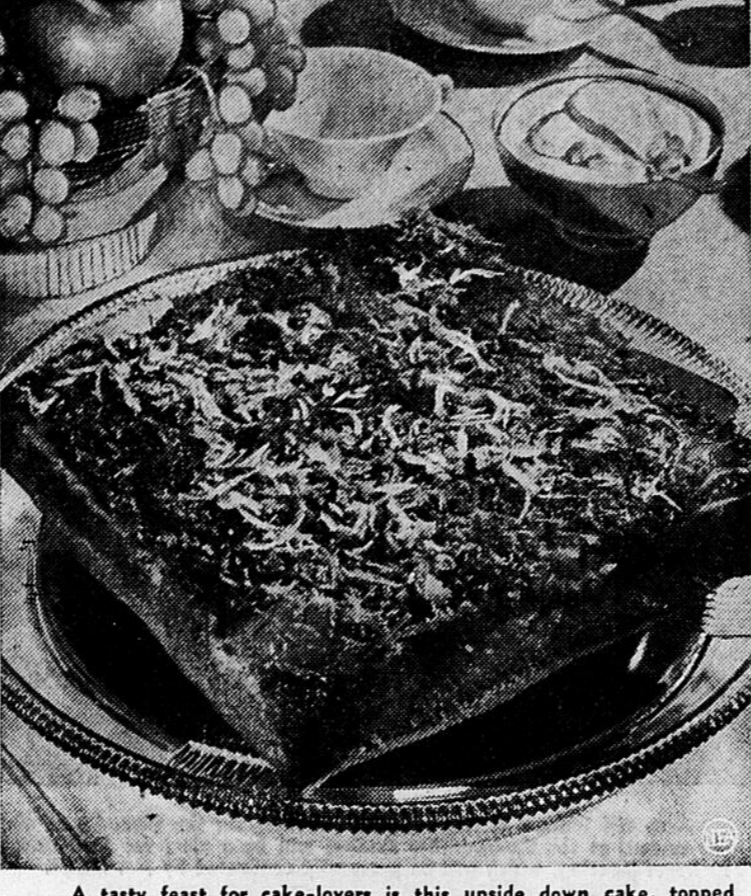
A tasty feast for cake-lovers is this upside down cake, topped with pineapple and shredded coconut and served with whipped cream.

Afternoon cake "snackers" attention! Here are two diversions for you.