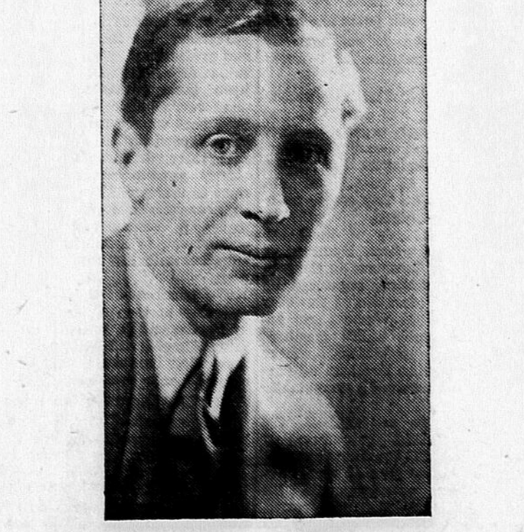
Famous Hungarian pianist and composer, who will be the guest soloist at the Westmount Women's Club annual musicale, to be held in Victoria Hall on Friday evening, January 12, at half-past eight o'clock.