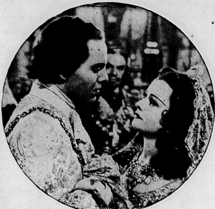
Joan Bennett and Louis Hayward in a scene from the film "The Man In The Iron Mask" opening Sunday at the Monkland United Theatre.