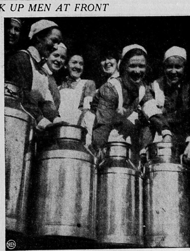
Every Lotta Svard member in the field means one more Finn to hold a rifle or load a cannon. Athletic, cultured and capable, these Finnish women man the home line of defense in war time in a unit as well organized as the army itself. Though much of their work is behind the lines, the soldiers of Finland best know them for their work in hospitals, canteens and field kitchens. Fresh milk, above, is one of many nourishing foods supplied by Lottas to fighting men.