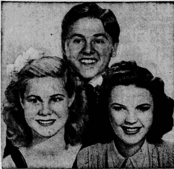
June Preisser, Mickey Rooney and Judy Garland in a scene from the film "Babes in Arms" which opens Saturday at the York United Theatre for a four day engagement.