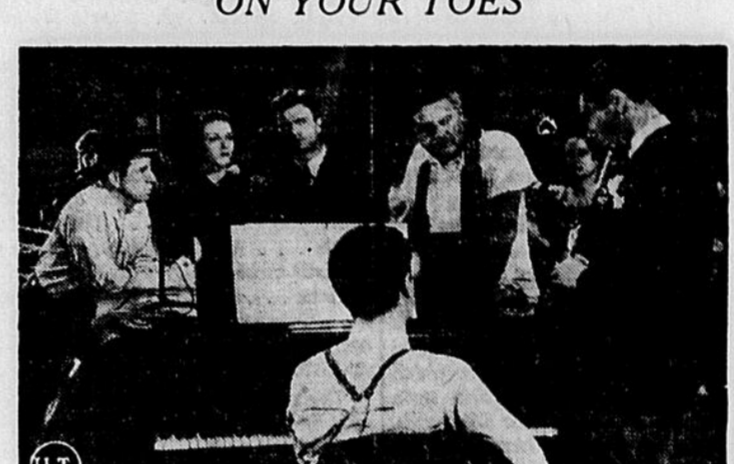
Eddie Albert, Zorina and player in a scene from the film, "On Your Toes" starting Sunday at the Westmount United Theatre.