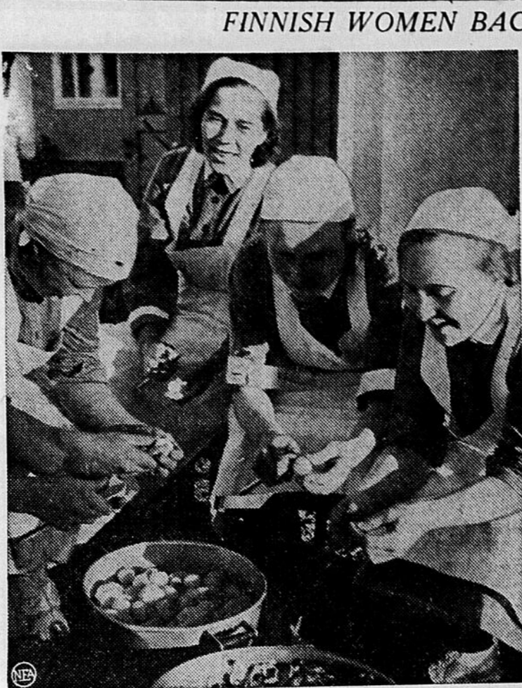
Finnish women have always helped their men in time of war, but never have they been as well trained and organized as now. More than 100,000 of them, members of the Lotta Svard organization, back up the work of the army by collecting money, aiding in hospitals, working as air raid wardens and taking over men's jobs at home. Closest to the front are those that work in Karelian field kitchens, above, specializing in broths, stews and porridges.

The Craftshop's sixty members have turned out 175 models to date. This shows the keen competition going on for the shield which will be awarded at the end of the season.