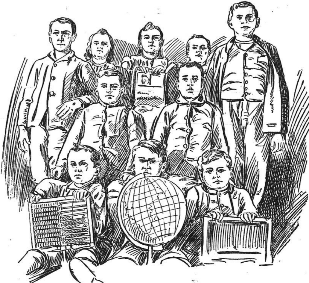
PUPILS OF GLENN LYNN S. D. ASSA, N. W. T.