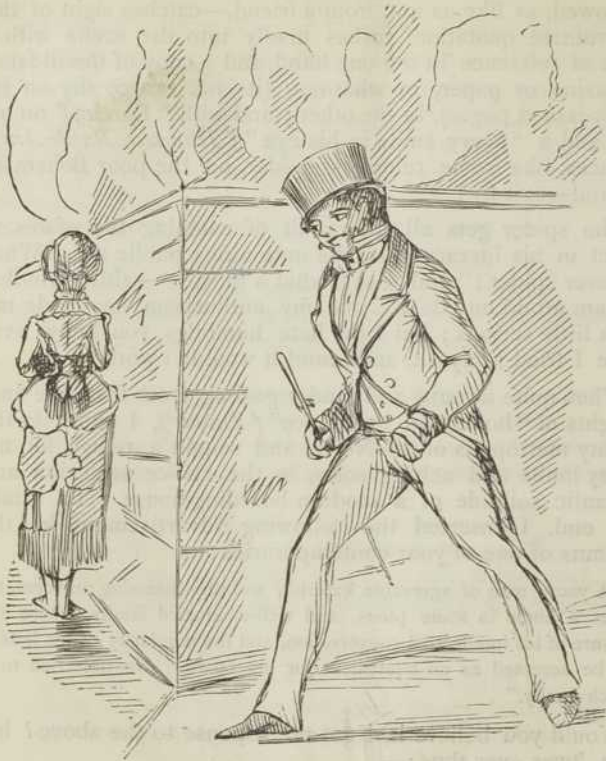
This is BINKS, of the Bank, in frantic pursuit of an unknown fair one, who has just turned the corner.