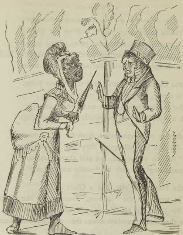
Suddenly, EVA turns to meet him. Tableau —Dismay of BINKS.