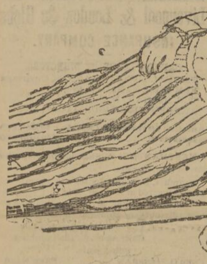
AS SEEN AT THE MORGUE

toner Jones was the first person in the city to receive the news and he gave orders to have the body placed in the morgue. As the word of the finding was not received in the city until nine o'clock last night it was impossible to get details of the discovery from the authorities of Saint aux Reollet but the facts are that some men were strolling through the fields near the village yesterday when they came upon the body. It was in the open field and it had probably been found some days ago, but it was close to a fence, where, as is well known, the snow collects in high drifts in the open country. The body must have been well covered up and was discovered very soon after. Its snowy shroud had melted away. Decomposition had not set in to any great extent. The men, on making the ghastly discovery, hurried off to the village and notified a doctor, who is a deputy coroner. The body was soon afterwards conveyed to the town hall, where a jury was empanelled and a verdict returned in accordance with the facts. The jewelry worn by the deceased was all found