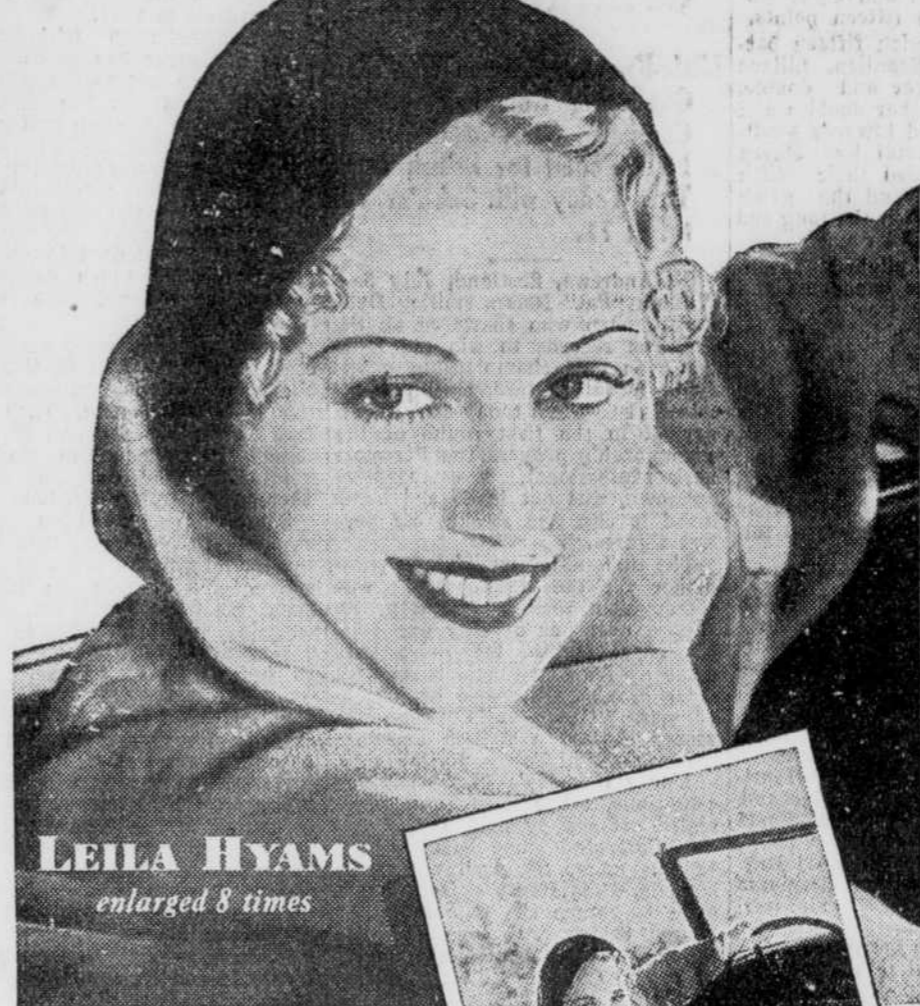
LEILA HYAMS enlarged 8 times

LEILA HYAMS' satin-smooth skin wins every heart. Like 9 out of 10 stars, she guards its beauty with fragrant, white Lux Toilet Soap.