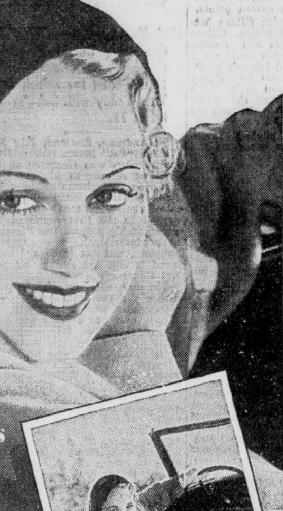
LEILA HYAMS enlarged 8 times

LEILA HYAMS' satin-smooth skin wins every heart. Like 9 out of 10 stars, she guards its beauty with fragrant, white Lux Toilet Soap.