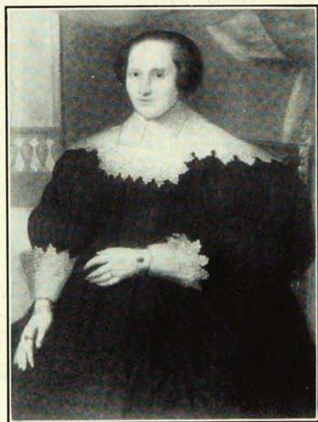
No. 26. "Portrait of a Lady," By Cornelis de Vos. 1585?-1651.