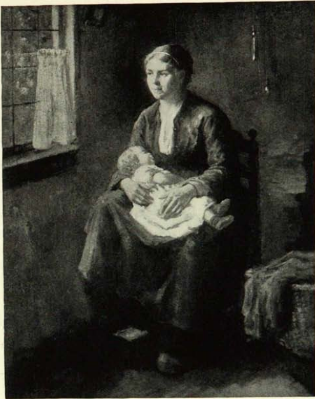
No. 100. "Ere Care Begins," by Bernard de Hoog.