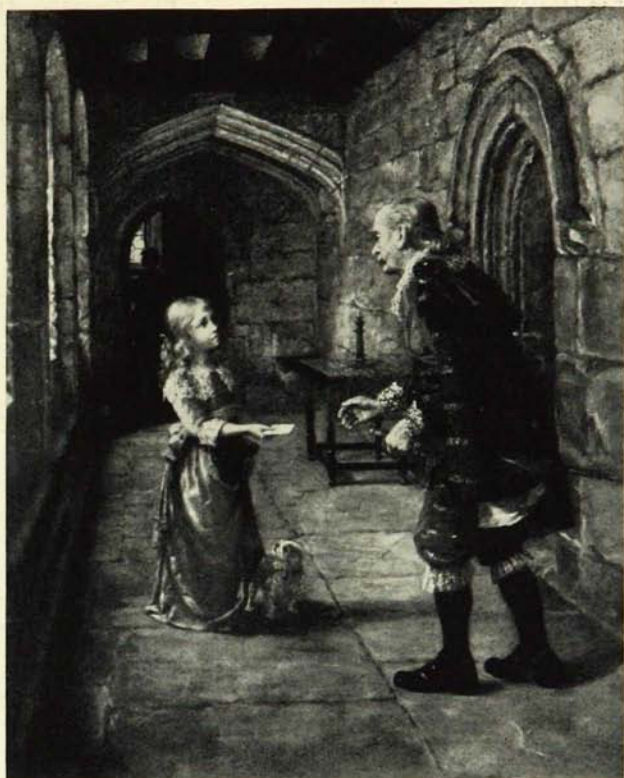
No. 137. "The Message," by Edgar Bundy, A.R.A.