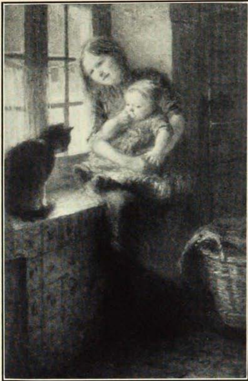
No. 81. "The First-Born," by B. J. Blommers.