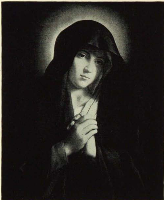
No. 23. "Mater Dolorosa," by Giovanni Battista Salvi, called Il Sassoferrato. 1605-1685.