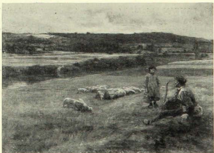
No. 37. "Noonday Rest—On the Marne," by L. L'Hermitte.