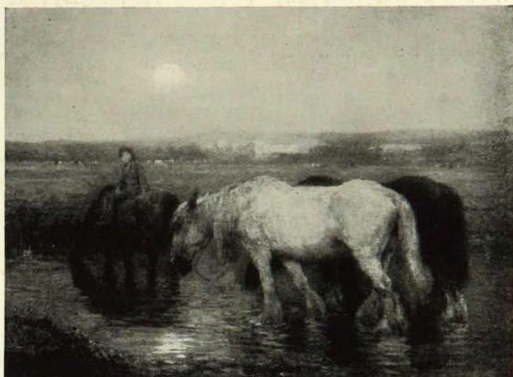
No. 138. "Watering Horses," by George Morland. 1763-1804.