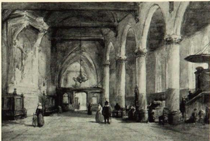
No. 62. "Interior of the Church at Maasland," by J. Bosboom.