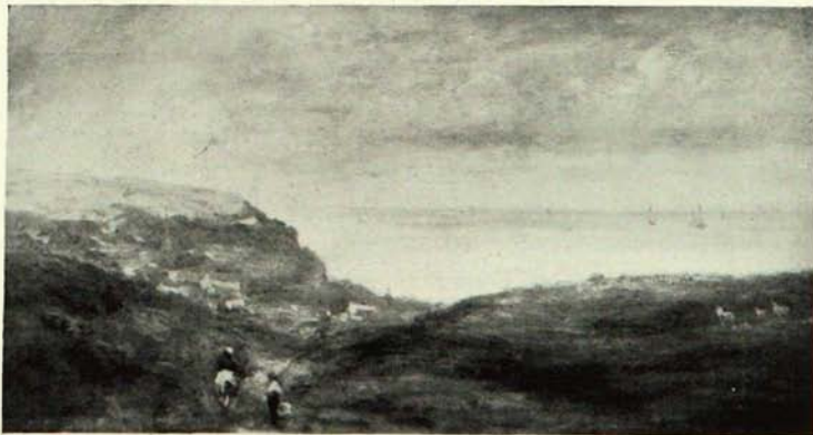
No. 27. " Souvenir d'Ault ," by J. B. C. Corot.