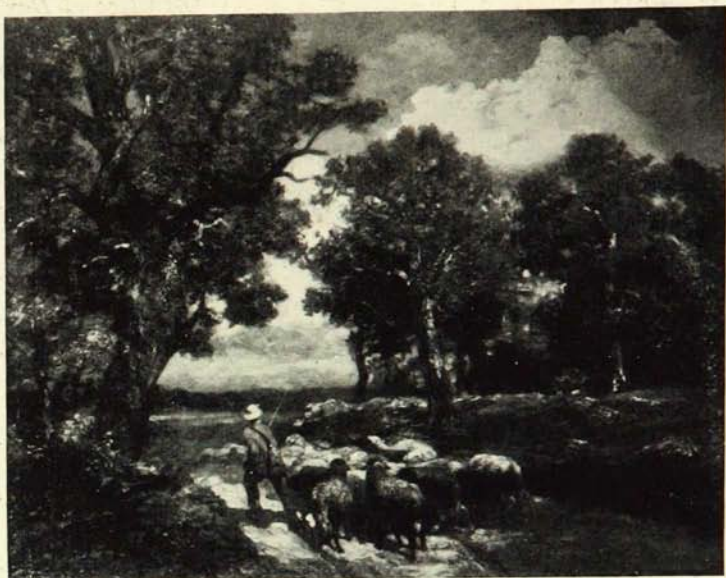
No. 32. "Approaching Storm," by Charles Emile Jacque.