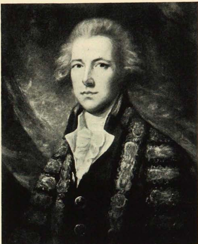
No. 16. "Portrait of William Pitt, Esq." by Thomas Gainsborough, R.A. 1727-1788.

20 BEECHEY, R.A. (Sir William) (English) 1753-1839