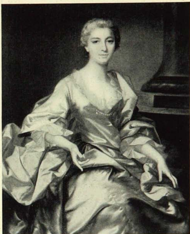
No. 24. "Portrait of the Duchesse d'Arnaud," by Louis Tocqué. 1696-1772.