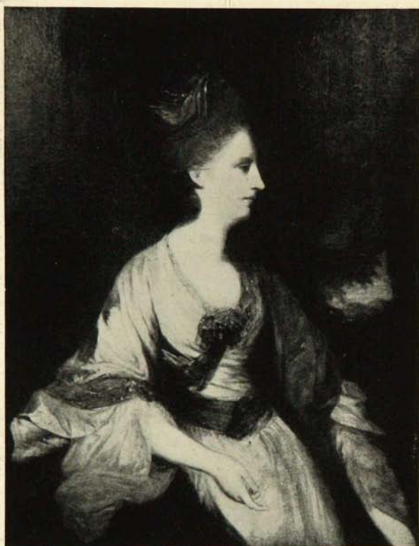
No. 7. "Portrait of the Countess of Thanet," by Sir Joshua Reynolds, P.R.A. 1723-1792.