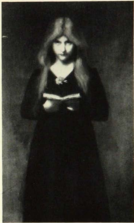
No. 43. "The Reader," by J. J. Henner.