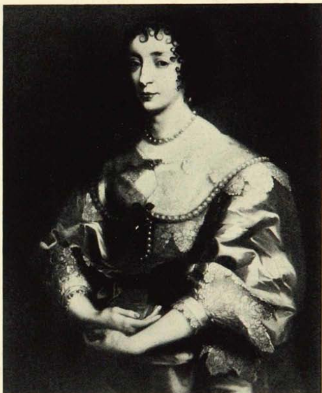
No. 1. "Portrait of Queen Henrietta Maria,"