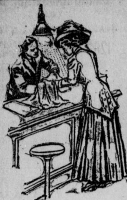
The Tungsten Lamp and Holophane Reflector will enable you to GET THE COLOR VALUES.