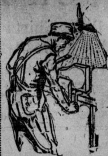
Holophane metal Reflectors place the light on the WORK and NOT in the EYES.