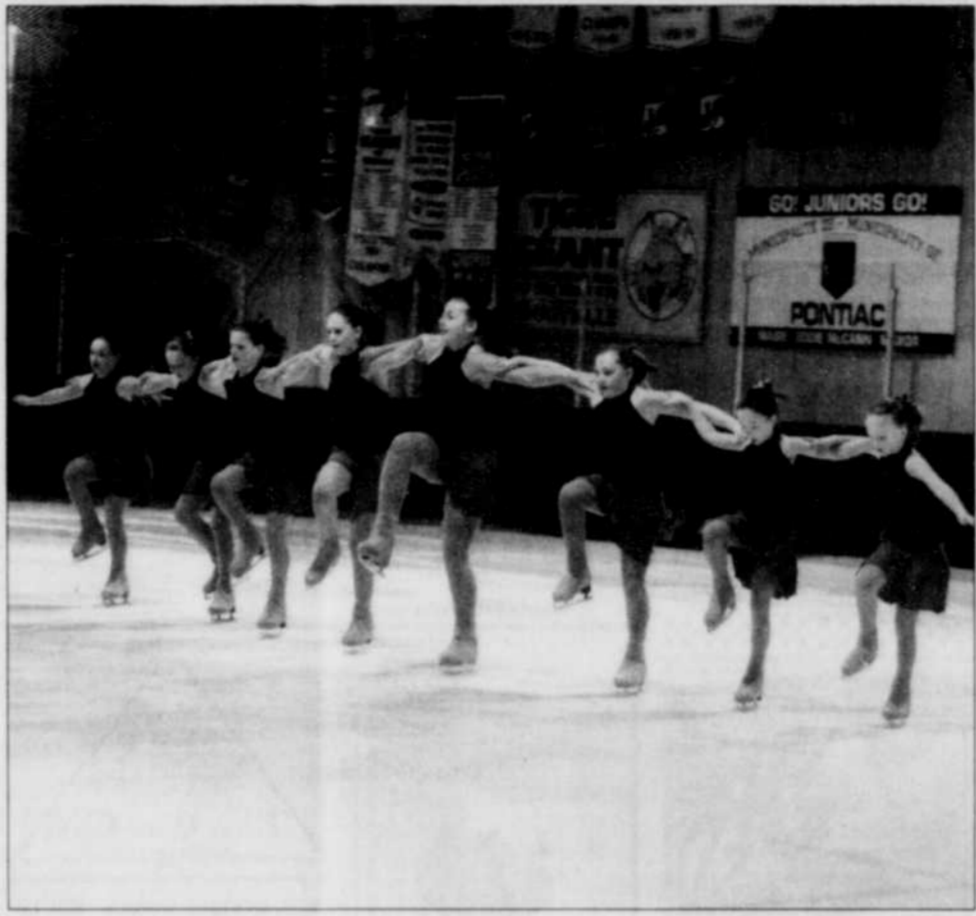
The Shawville Figure Skating Club put on Broadway on Ice , a skating concert that took place on Friday. There were 48 participants, all members of the Shawville Figure Skating Club. For this routine the skaters performed to a song from Darkness and Magic .