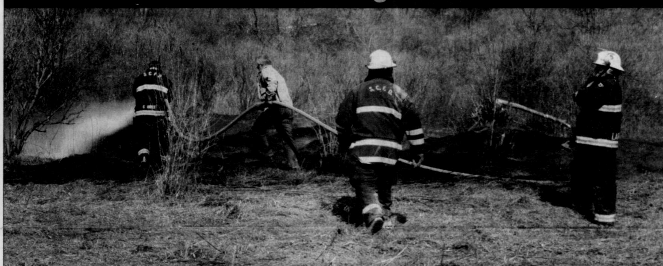
Firefighters work to put out a fire that took place on Monday in a field by Décor Sylvia on Main Street in Shawville. There were no injuries or building damage but there was some property damage. The cause of the fire is still unclear.