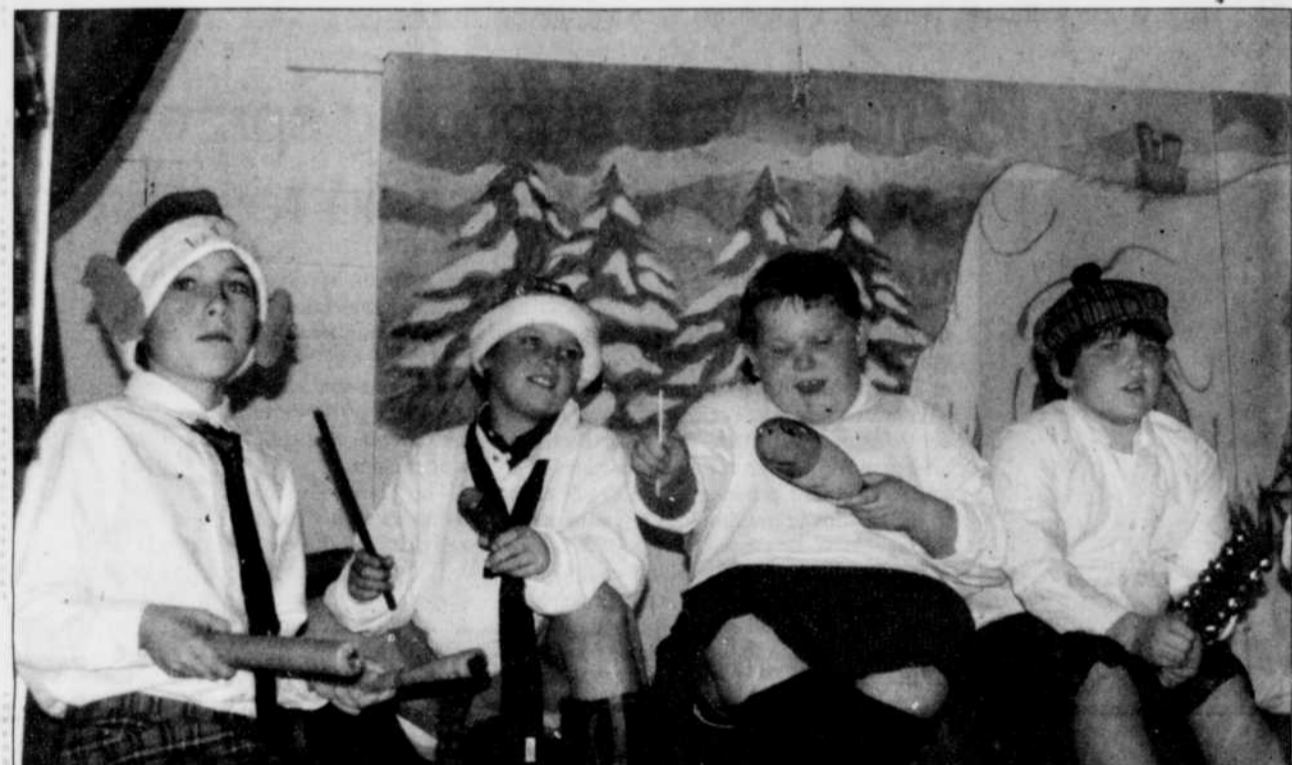
A group of boys have a festive jam during the choir concert Dec. 16 at Onslow Elementary school in Quyon. The concert featured a number of songs and performances by the students, including a Scottish dance where students danced in kilts.