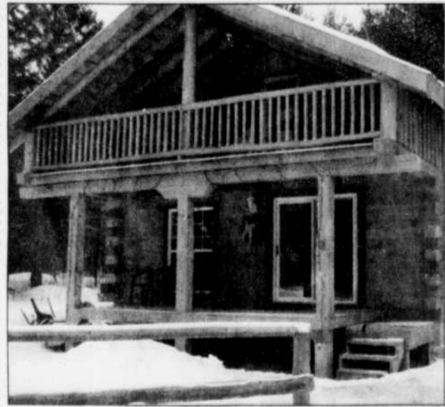
The Bear is one of the seven cabins nestled along the Coulonge river at Les Cabines de la Chute in Mansfield cozily awaiting to accommodate guests.

Les Cabines de la Chute is also rated a three-star residence in a four-star system for the cottages and chalets category.