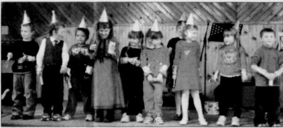
The pre-kindergarten and kindergarten students of École Ste-Marie put on a skit as little robotic elves at their community Christmas dinner event held at the Otter Lake R.A. hall on Monday.