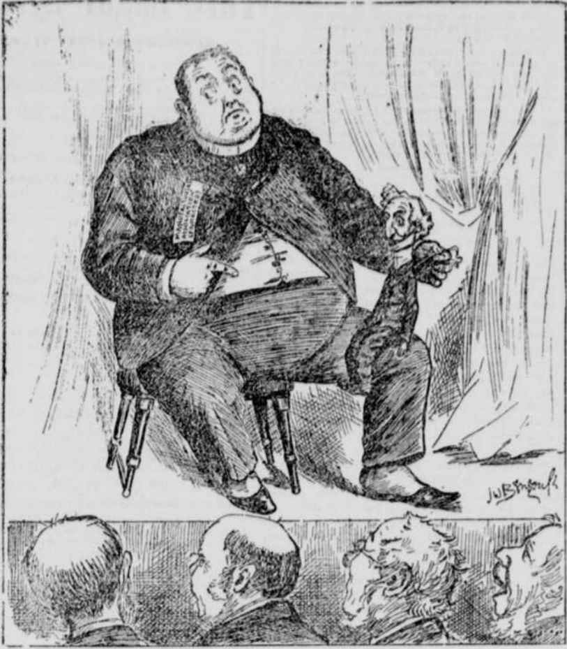
THIS IS THE VOICE OF THE VENTRILOQUIST.

Prof. Monopoly—"New, Sir John, instruct these good people in the true principles of loyalty." The Lay Figure ("wicked" by the Professor)—"Well, gentlemen, true loyalty is free trade in natural products with the Yankees; but free trade with them in manufactured articles is rank treason to the Old Flag"—Grip.