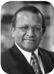
Alan DeSousa, FCA Mayor of Saint-Laurent