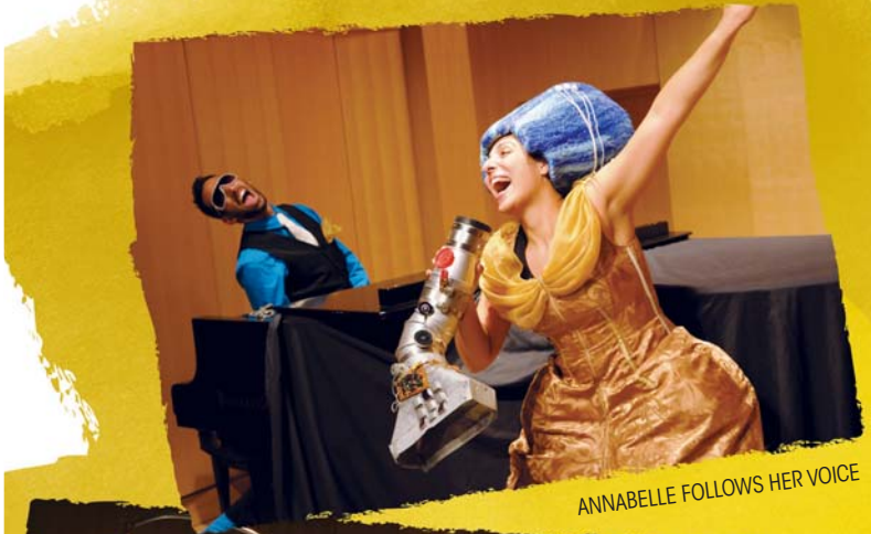
ANNABELLE FOLLOWS HER VOICE