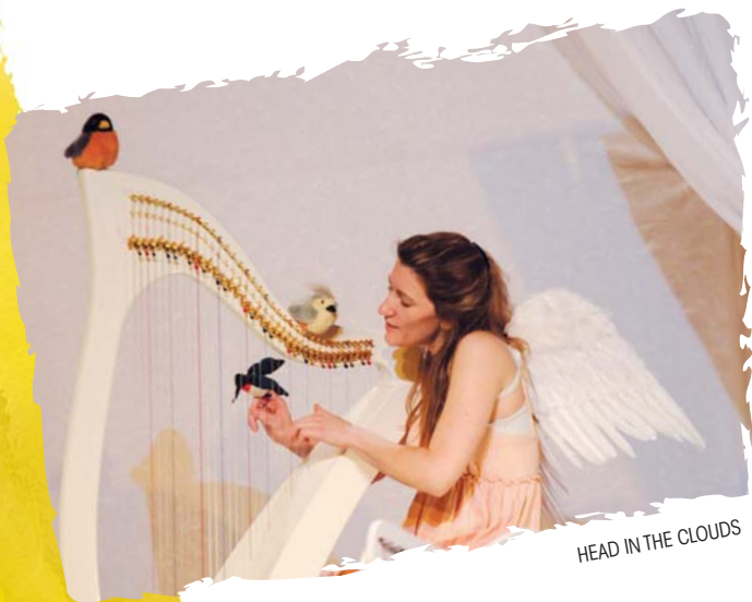
HEAD IN THE CLOUDS