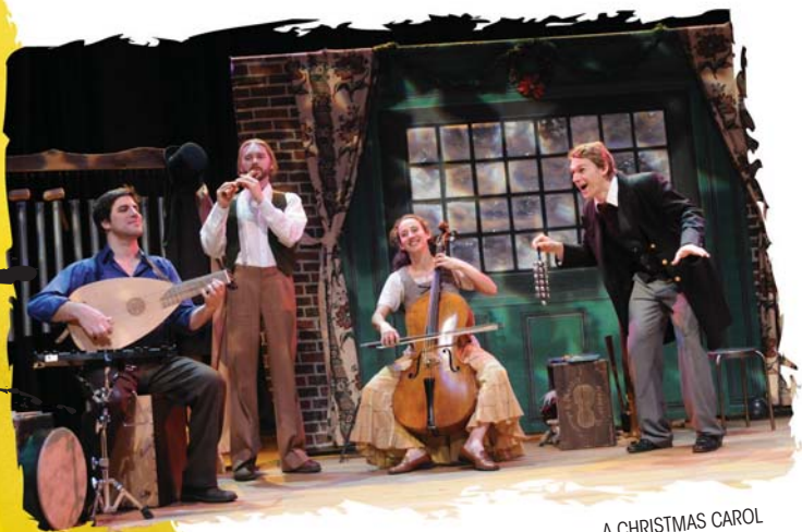
A CHRISTMAS CAROL