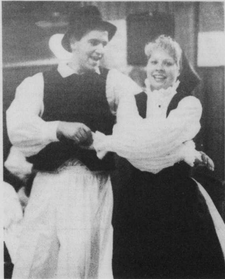
Canadians of German origin celebrate the fall harvest at Sutton last weekend.

The singing and dancing went on into the night Sunday with time out for sausage and sauerkraut, and of course, beer.