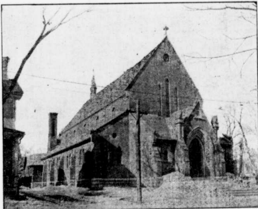
St. Peter's Church, Sherbrooke.