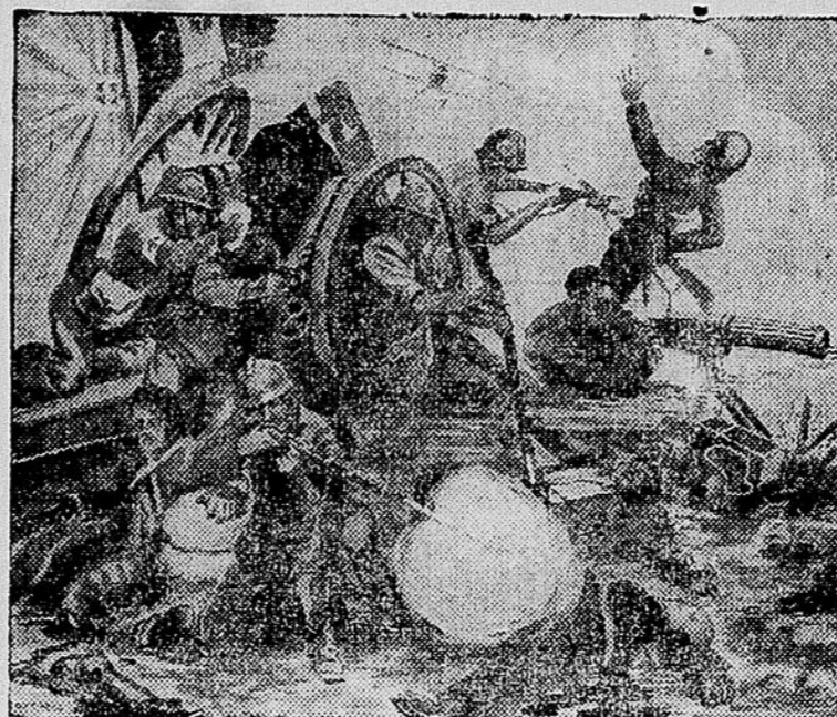
This thrilling war film starts Monday at His Majesty's Theatre for a continuous daily showing 1 to 11 p.m.