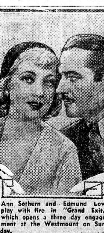
Ann Sothern and Edmund Lowe play with fire in "Grand Exit," which opens a three day engagement at the Westmount on Sunday.