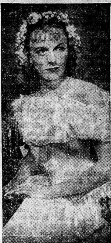
Margaret Sullivan who will be presented in "So Red The Rose," with Randolph Scott and Walter Connolly starting Sunday for three days at the Westmount.