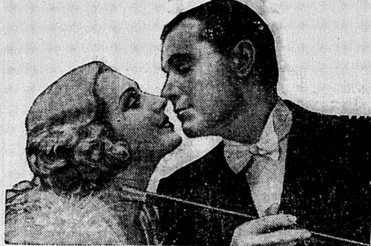
Jean Arthur and Herbert Marshall in "If You Could Only Cook," which is now playing at the Westmount United Theatre until Saturday night, and which opens for three days at the Seville on Sunday.