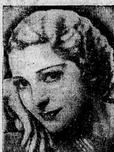
Beautiful Helen Vinson who has a featured role in "Transatlantic Tunnel," which stars Richard Dix, now playing at the Seville until Saturday.