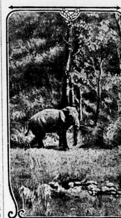
The Monarch at Home.