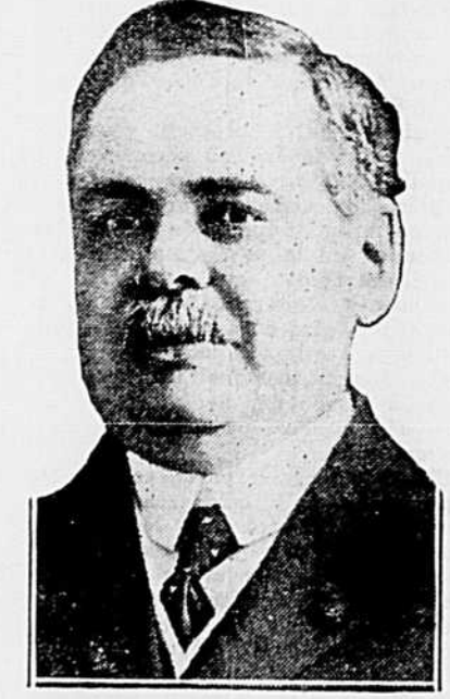
SIR LOMER GOUIN, K. C. M. G.

In 1909, the Gouin Government appointed a Commission for the protection of consumers and the public against the abuses by Public Utility Companies, such as transportation, water-work, light, heat, etc., companies.