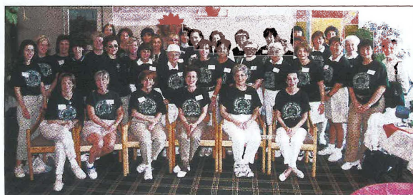
Hats off to the Auxiliary volunteers who helped the day run smoothly.