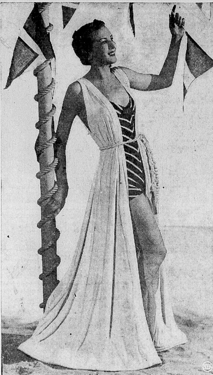
The bathing suit is ever so brief, but the voluminous beach robe affords the modest touch the smart Parisienne demands this Summer. The Maggy Rouff coat is of white jersey, drawn in at the waist with a thick cord. The swim suit is bright navy and has white stripes worked chevron-wise.