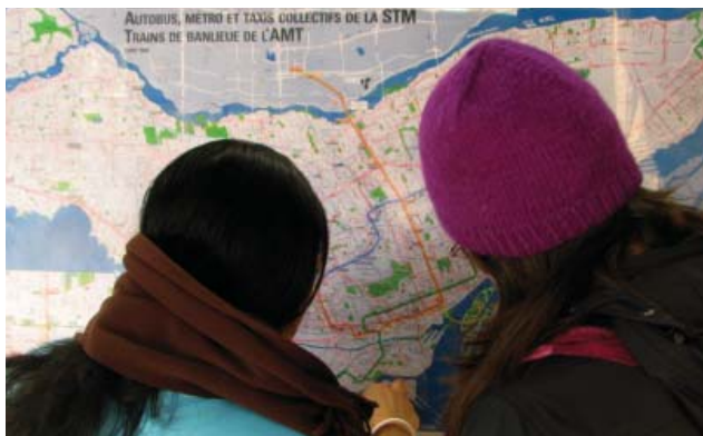
A Words for Women participant learns how to find her way around the city...