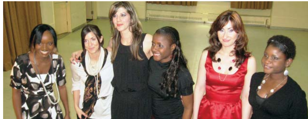
Participants of the Fringues & Cie program at the fashion show organized during the "Semaine des entreprises d'insertion du Québec".