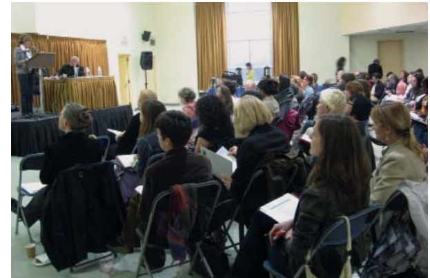
International Conference - Youth, Media and Sexualization, May 29, 2009 at the YWCA.