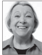
PIONEER ★ Lise Payette