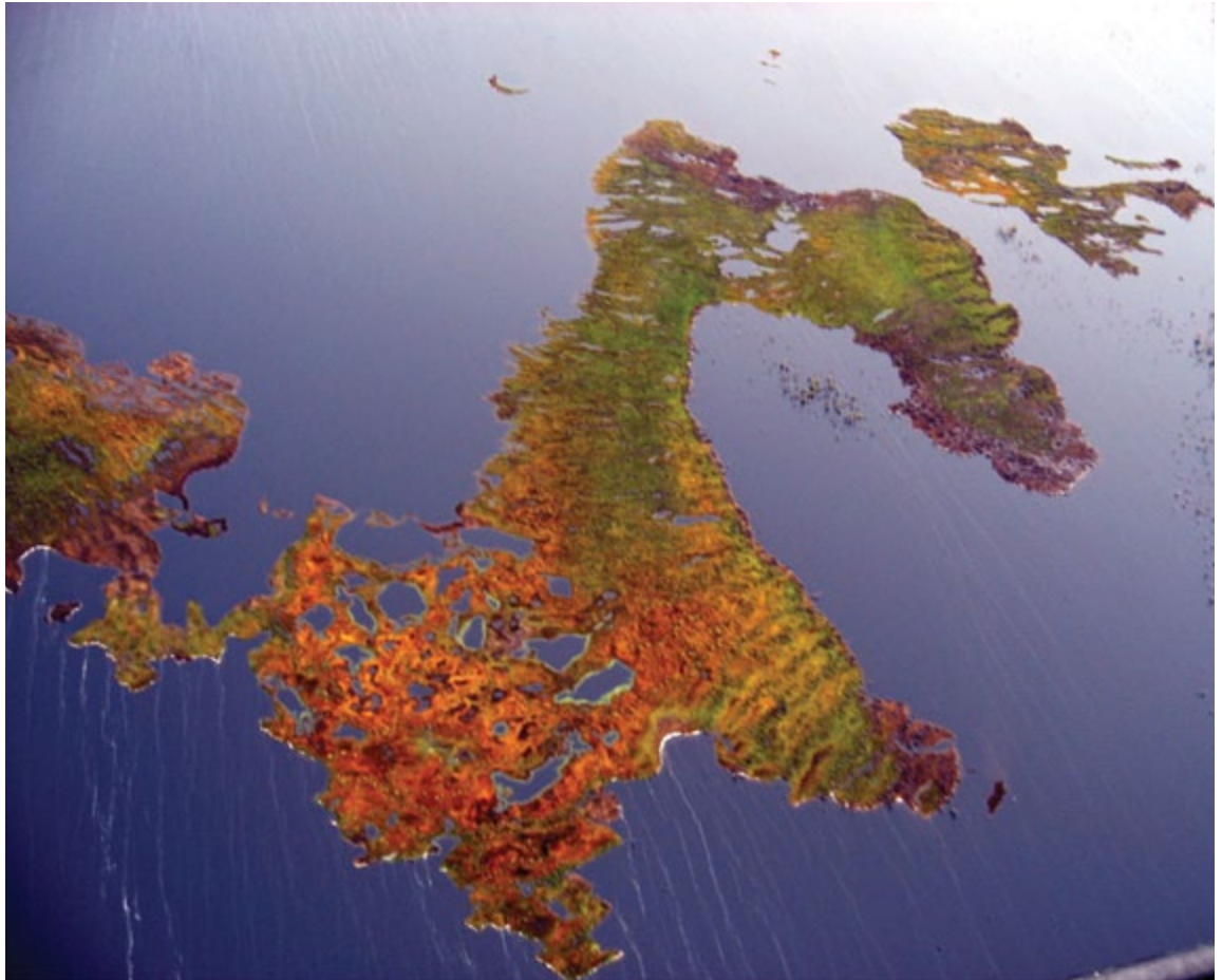
Floating peatland in the reservoir

Hydro-Québec needs to monitor floating peatlands in critical areas of the reservoir to ensure that they do not hinder operation of the facilities.