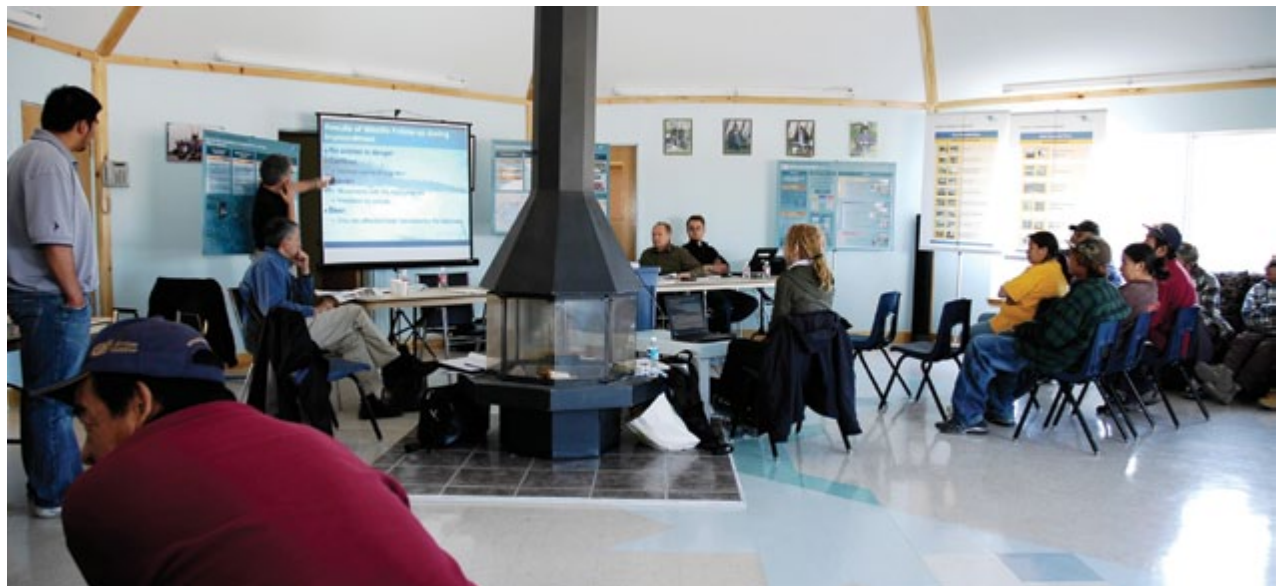
Information session in a Cree community

The Monitoring Committee visits the Cree communities on an annual basis to present a summary of the mitigation measures and environmental follow-up studies completed the previous year.