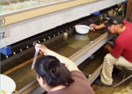
Crees working at the lake sturgeon production lab

Cree businesses obtained contracts worth $430 million to conduct these activities. In addition, by sharing and putting their traditional knowledge to use, the Cree communities and the tallymen of the traplines affected by the project played an active role in carrying out the environmental studies and work. Contracts were awarded directly to the tallymen for different types of work, including land clearing and removal of wood debris. This was a first for both SEBJ and the Crees.