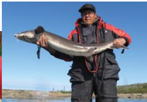
Cree participant fishing for lake sturgeon in the Eastmain