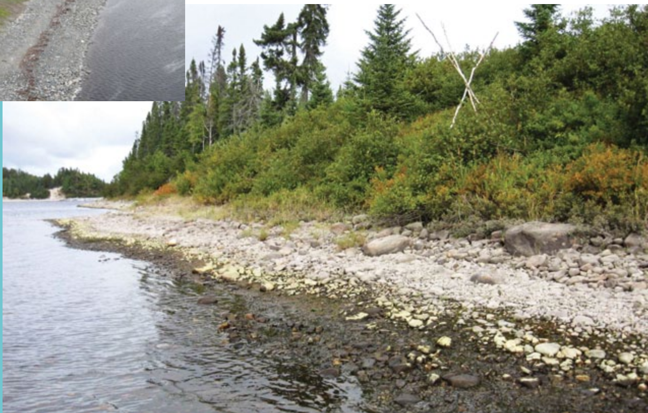
Monitored section of banks at KP 203 of the Eastmain