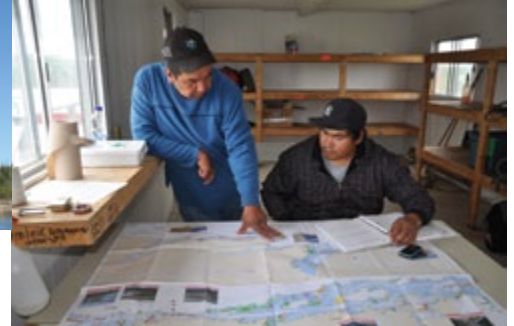
Crees helping to plan the wood debris inventories in Eastmain 1 reservoir