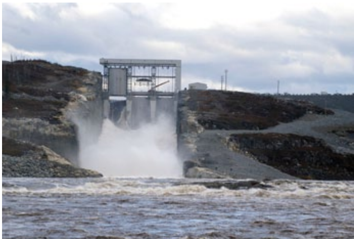
Spillway, looking downstream