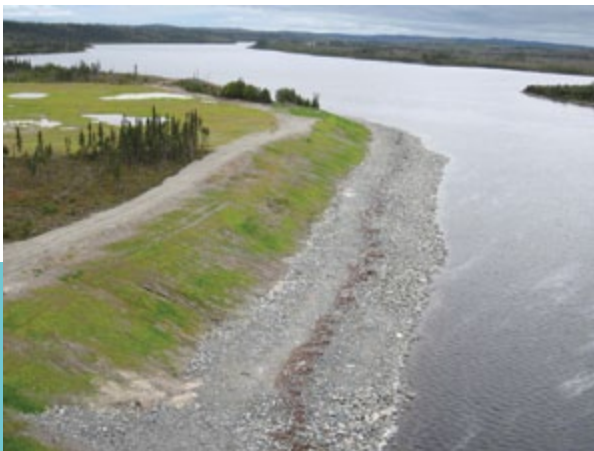
Slope protected with stone riprap at KP 214.5 of the Eastmain

At the end of the follow-up period in 2009, the physical integrity and effectiveness of the weir and bank protection structures were confirmed. The target areas are now stable and are little affected by erosion.