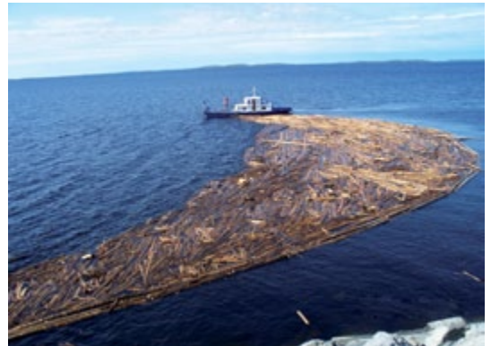
Removal of wood debris