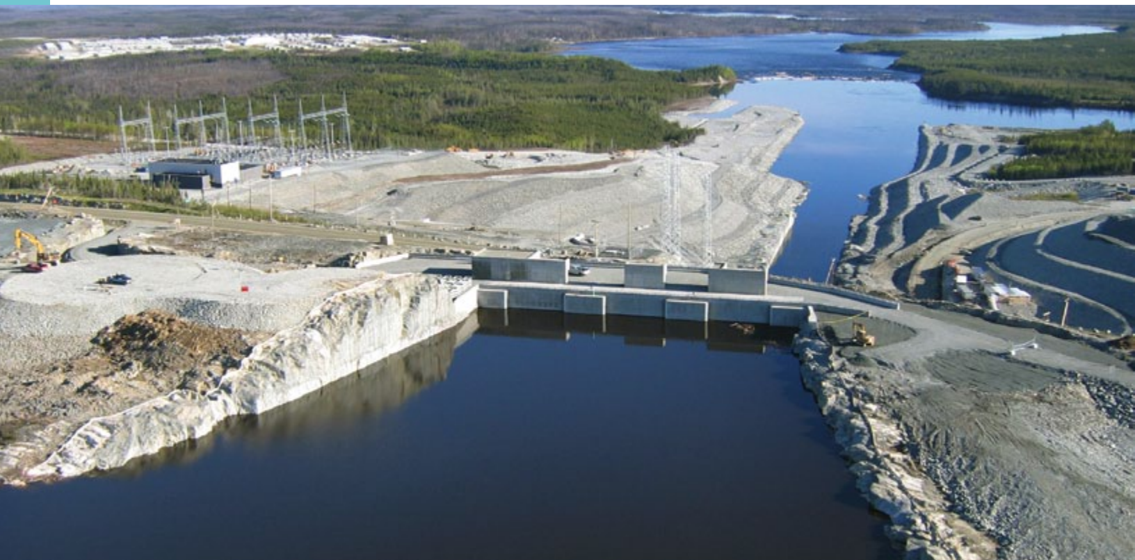
Eastmain-1 powerhouse intake