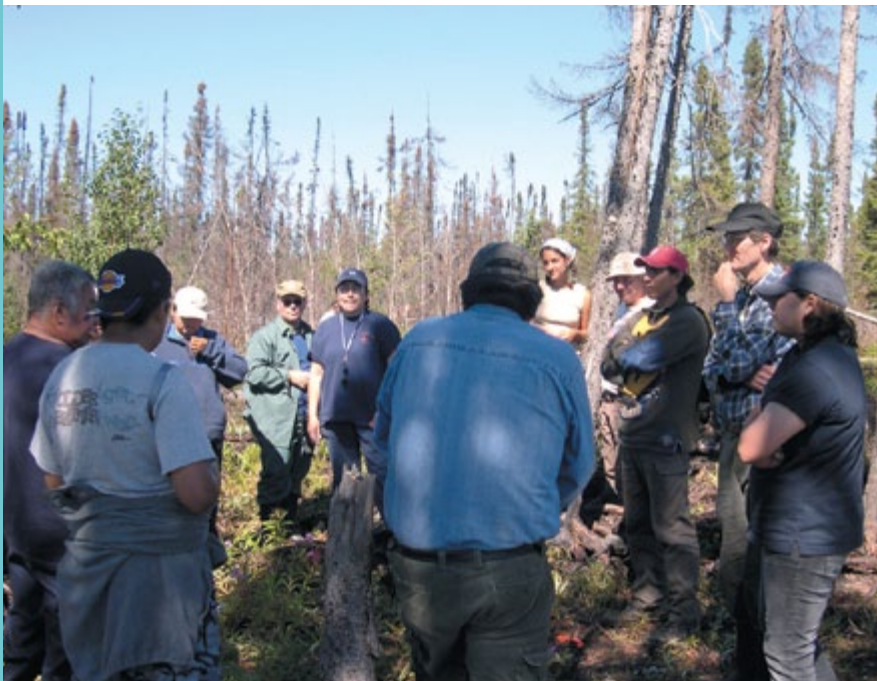
Meeting of archaeological research teams from SEBJ and the Nadoshtin Corporation