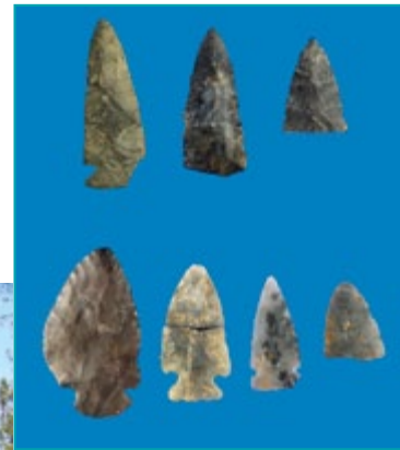
Chipped stone tools discovered in the project study area