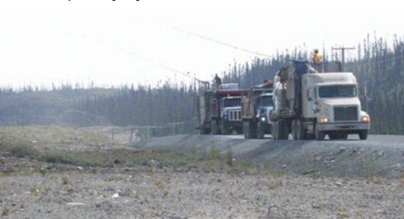
Hydroseeding along roads